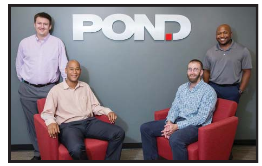
Consider enrolling several team members in YLP and sharing this industry participation with clients and project team members in your company newsletter!