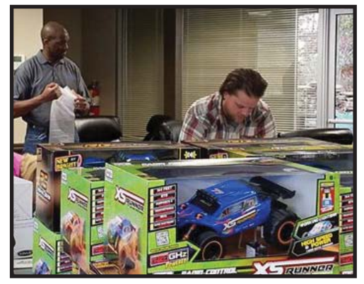
Members proudly take ownership of contributing holiday gifts to 80 children at Hillside Hospital. They also encourage firms to contribute to Toys for Tots.

The program relies heavily on YLP members volunteering their time, talents and energy working together with Council members to implement YLP activities and the ongoing YLP Action Plan. This plan is designed to ensure the quality growth of the program and an outstanding experience for all YLP participants.