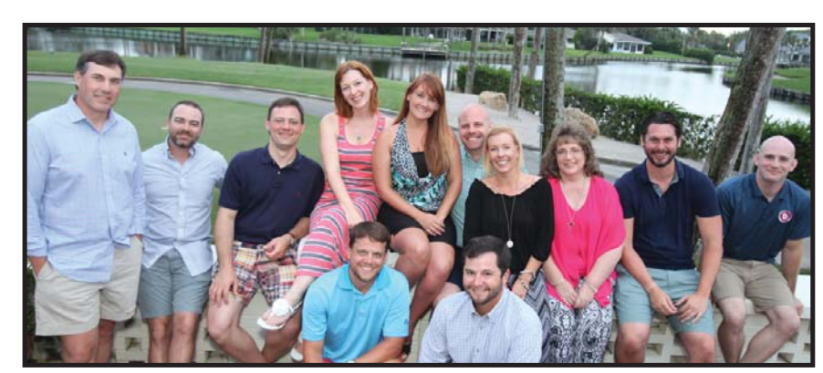
YLP members participate each year in AGC Georgia's Annual Convention. This group participated in the convention at Ponte Vedra Club & Inn in June 2017.