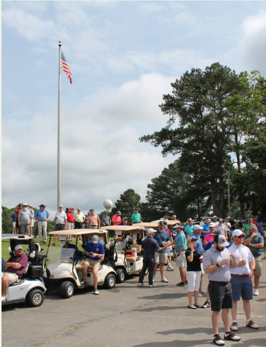
Golfers gather at the start of the annual Golf Classic . The tournament and a sporting clays competition have recently raised more than $92,576 for charity in one year.