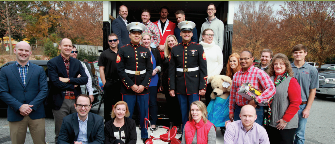
YLP participates annually in the Toys for Tots Drive , sponsored by the Marine Corps. AGC Georgia members have donated thousands of toys in the past decade and have enthusiastically support the project.