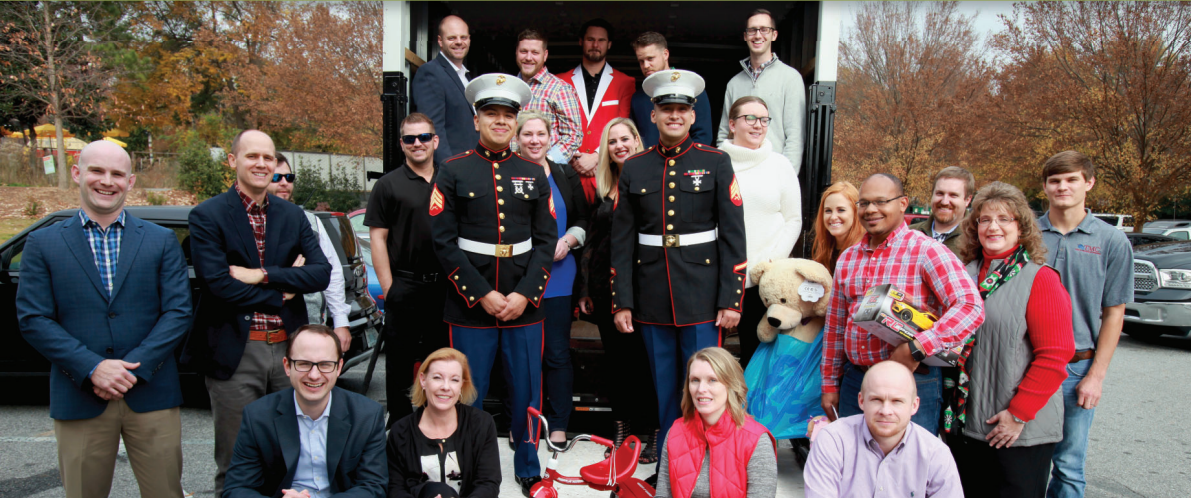
YLP participates annually in the Toys for Tots Drive , sponsored by the Marine Corps. AGC Georgia members have donated thousands of toys in the past decade and have enthusiastically support the project.