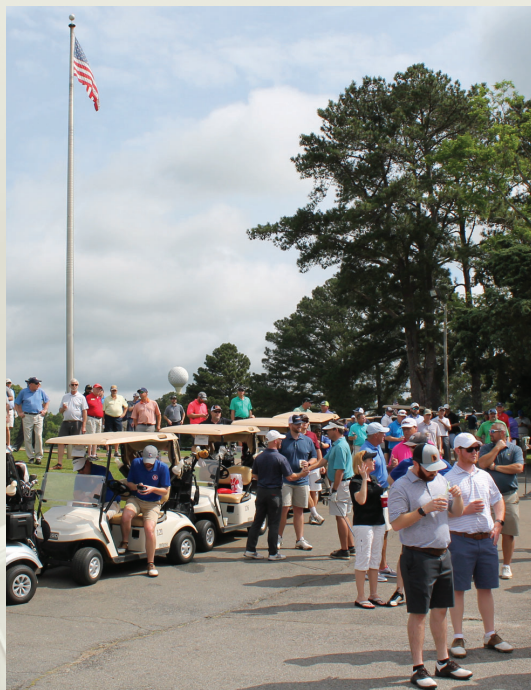
Golfers gather at the start of the annual Golf Classic . The tournament and a sporting clays competition have recently raised more than $92,576 for charity in one year.