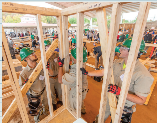
High school students show off their construction skills during preliminary competitions leading to the SkillsUSA National event . YLP raises funds to cover travel expenses of Georgia students who earn the right to compete nationally. Skills competitions help increase interest in the construction trades generally, as well as help teach students skills they can use professionally.

YLP participants can't stop talking about how much they benefit from the program, and some even fudge their birthdates to stay in the program "just one more year" after they turn 40.