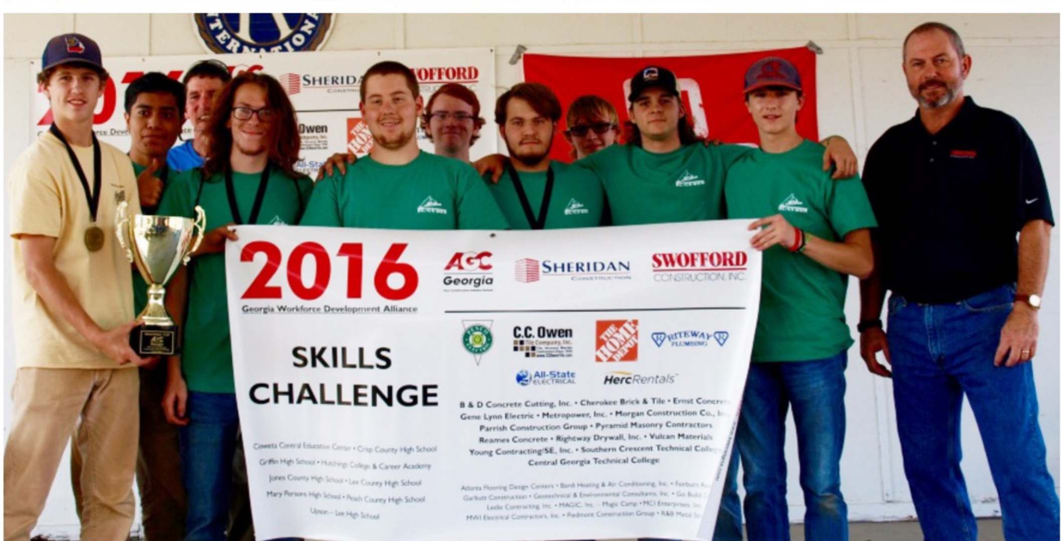
Top row: Students compete in masonry at the Northeast Georgia Skills Challenge. Bottom 2 rows: Students compete in plumbing and carpentry at the Southern Crescent/Central Georgia Skills Challenge. The Overall Regional Champion Award was presented to Mary Persons High School's construction students. To view more photos from the event, please visit http://bit.ly/2iaW5SE .

The East Georgia Workforce Development Alliance held their 3rd Annual Skills Challenge on November 17. More than 70 students from 11 east Georgia schools participated, and 160 students observed the day's events. New this year, Statesboro High School's Audio/Video Technology & Film Pathway students filmed the competition and Awards Ceremony. Throughout the day, the show was viewed 240 times across the country.