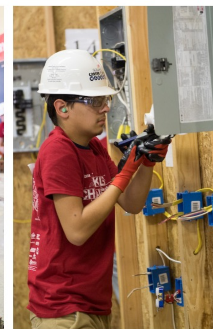
(clockwise from top left) Students participate in carpentry, welding, electrical, and masonry at the East Georgia Skills Challenge. To see more photos from the event, please visit http://bit.ly/2hahAkx .