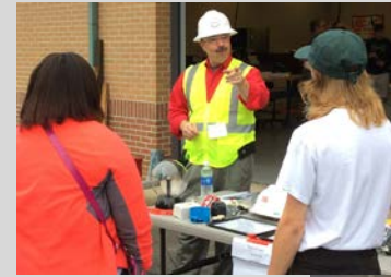
A student participates in a simulator.