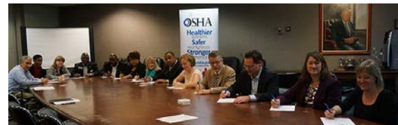
Industry professionals renew the OSHA Sustainable Workforce Alliance Partnership. Click here or visit http://1.usa.gov/1O3PFbX to read more.