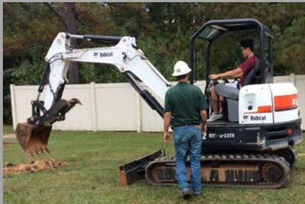
A Sheridan Construction superintendent helps students operate an excavator at the Macon event.

In November, contractors worked with educators to offer students opportunities to learn about careers in construction and try their hand at many of the skills.