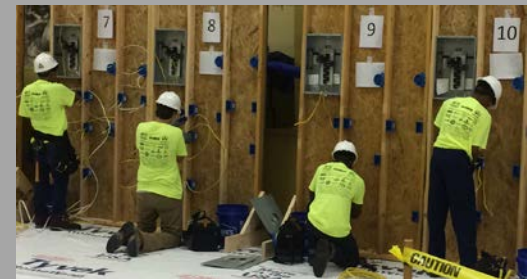
Students compete in the electrical category at the Augusta Fairgrounds.

competed in plumbing, welding, carpentry, electrical, and masonry. More than 70 competitors participated. Industry volunteers judged the events. Students will compete in the SkillsUSA Region 6 Championship on January 22, 2016.