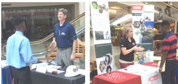
Representatives from (l-r) Elkins Construction, LLC and Gilbane Building Co. talk to students at the "Ready to Work" job fair.

On Thursday, October 1, Savannah-Chatham County Schools hosted a job fair inviting employers from several industries. The purpose of the "Ready to Work" fair was to showcase job opportunities to local students. Member firms, JE Dunn Construction, Elkins Construction, LLC, Gilbane Building Co., and Mock Plumbing and Mechanical, Inc. represented the construction industry.