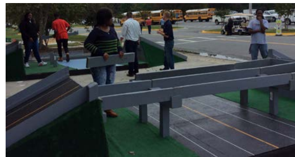
Students build at the Department of Transportation bridge exhibit at Careers in Construction Day in Macon (above) and weld at East Georgia Skills Challenge (below.).