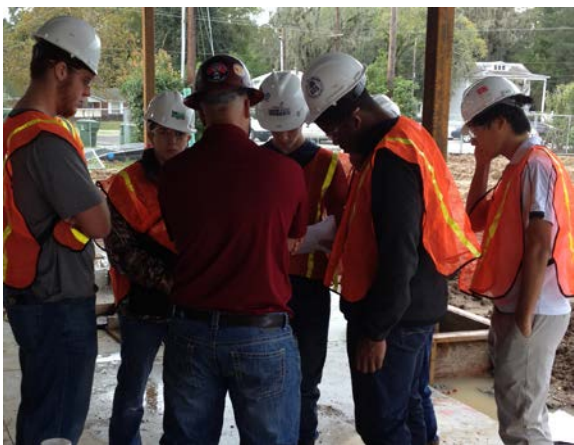
Statesboro High School Construction Program tours an Elkins Construction, LLC project.

In early November, Statesboro High School Construction Academy students toured Elkins Construction, LLC's City of Pooler jobsite. Field team members created a scavenger hunt where students were divided into three groups and had to identify the elements on the plans and on the site. This visit was the second for the construction pathway students. Between the visits, members of Elkins team went to the school to give hands on training in metal stud framing and masonry.