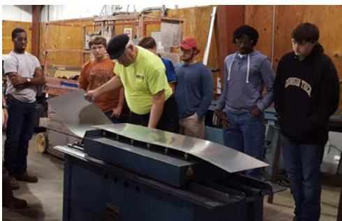
Students watch as a Mock Plumbing employee demonstrates a machine in the fabrication shop.

In early November, Statesboro High School Construction Academy students toured Elkins Construction, LLC's City of Pooler jobsite. Field team members created a scavenger hunt where students were divided into three groups and had to identify the elements on the plans and on the site. This visit was the second for the construction pathway students. Between the visits, members of Elkins team went to the school to give hands on training in metal stud framing and masonry.