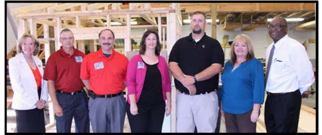
(above) Present at Upson-Lee's tour were superintendent, principal, vice principal, construction teacher and members from MetroPower and Piedmont Construction Group.