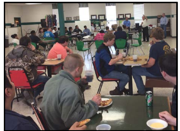
The school's counselor handpicked several dozen seniors with an interest in construction to visit with contractor representatives during their lunch to learn more about the industry.