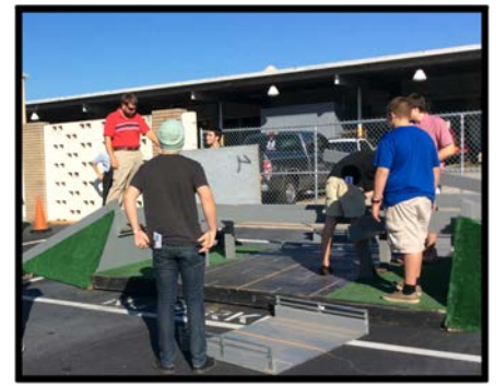
(above) Students visited South Georgia's Career Day held at Wiregrass Technical College in September. The bridge building competition station was a big hit!