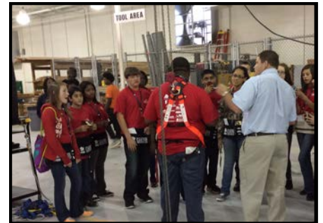
(below) During the Southwest Georgia Career Day, participants were allowed to try on fall protection equipment.