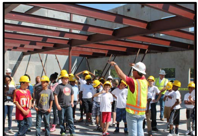
Over 50 students involved in Godley's Future Business Leaders of America Club toured the jobsite.

In October, members Gilbane Building Company, Mock Plumbing and Mechanical, Inc. and H. A. Sack Company, Inc. introduced students in Pooler to construction. The visit included a presentation in the field office describing the scope of the project, what technology is being used to manage it. Students walked the jobsite, meeting employees and hearing from each of them about their roles on the project and what path they took to get to where they are today in the construction industry.