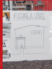
CONSTRUCTION CAREERS DISPLAYS