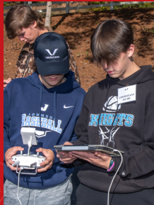
BROADCAST NEWS PRODUCTION