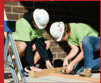
FINE FURNITURE/ WOODWORKING