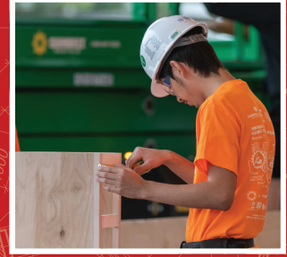
FINE FURNITURE/ WOODWORKING