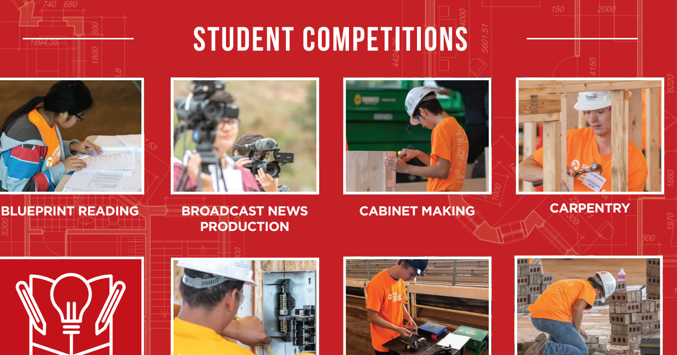
CONSTRUCTION CAREER DISPLAY