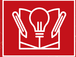
CONSTRUCTION CAREER DISPLAY