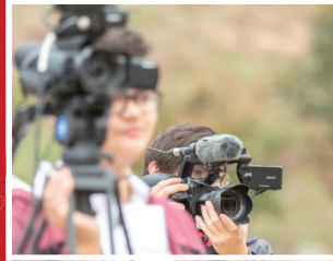
BROADCAST NEWS PRODUCTION