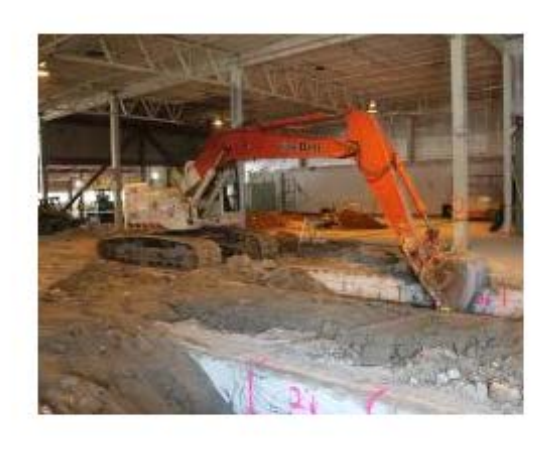
Brent Scarbrough & Company MARTA Integrated Operations Center Chamblee