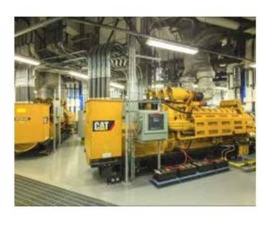
Eckardt Electric 51 Peachtree Center Avenue Generator and UPS Replacements Atlanta