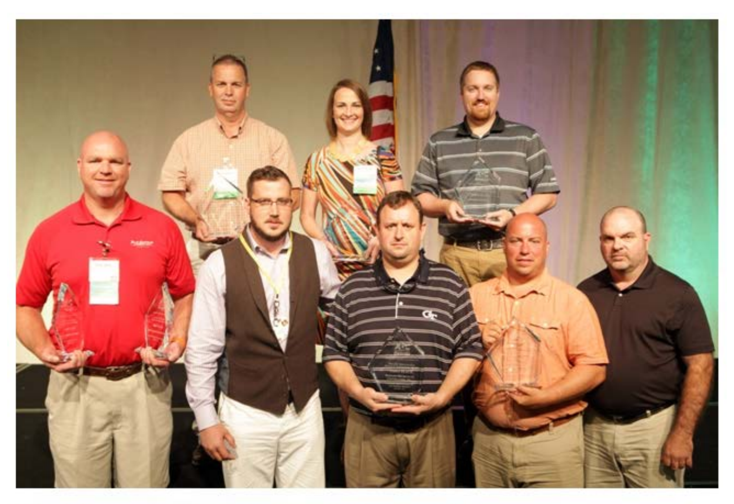
Pictured above are representatives of projects earning first place in the Specialty Contractor Division of the AGC Georgia's 2014 Build Georgia Awards Program.

Each year a panel of industry professional select outstanding construction projects to receive the Build Georgia Award, and the Build Georgia Specialty Award, AGC Georgia's highest levels of distinction