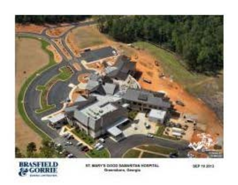
Rawlins Mechanical Contractors, Inc. St. Mary's Good Samaritan Hospital Greensboro