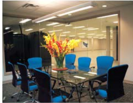
Van Winkle & Company, Inc. Edata Systems Center at Marble Mill Kennesaw, GA