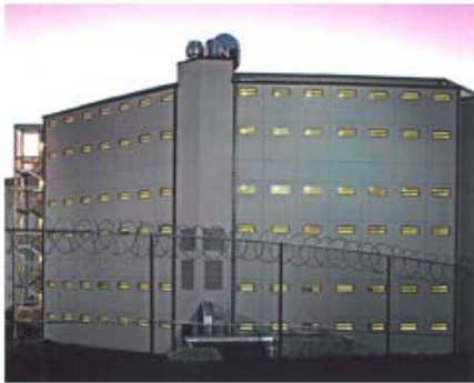
Turner Construction Company Hall County Jail and Core Support Center Gainesville, GA