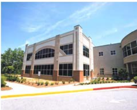
Hogan Construction Group, LLC. Fowler YMCA Addition & Renovation Norcross, GA Also earned First Place in the Best Sustainable Building Practices Division