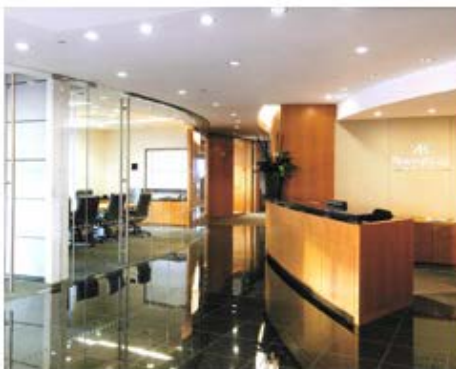
Cork-Howard Construction Co. Alliance Bernstein Expansion Atlanta, GA