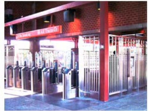
J. M. Wilkerson Construction Co., Inc. MARTA Fare Collections System Upgrades Atlanta, GA