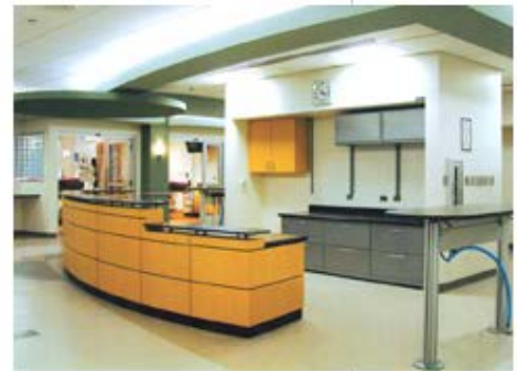
Gay Construction Company Emory University Hospital Expansion Neuro Critical Care Unit Atlanta, GA