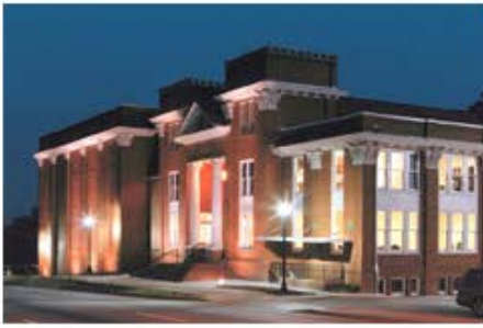
LUSK & Associates, Inc. Aurora Theatre City of Lawrenceville Performing Arts Center Lawrenceville, GA Also earned First Place in the Best Sustainable Building Practices Division