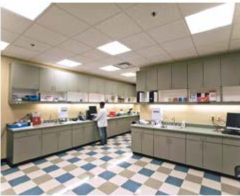
Hogan Construction Group, LLC. Gwinnett Department of Public Health Lawrenceville, GA