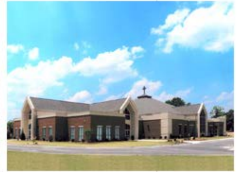
Chris R. Sheridan & Co. Sacred Heart Catholic Church Warner Robins, GA