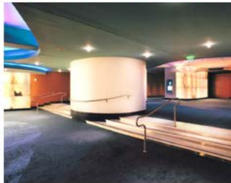
Brasfield & Gorrie, LLC GAI Expansion Atlanta, GA