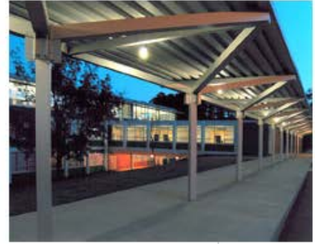
C.D. Moody Construction Company Crawford Long Middle School Atlanta, GA