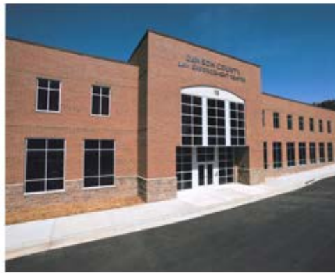
Manhattan Construction Company Dawson County Sheriff's Office & Adult Detention Center Dawsonville, GA