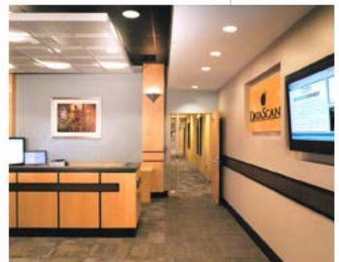
Cork-Howard Construction Co. JM Family/DataScan Alpharetta, GA