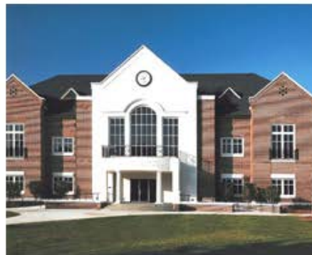
New South Construction Company, Inc. Wesleyan School Fine Arts and Administration Complex Norcross, GA