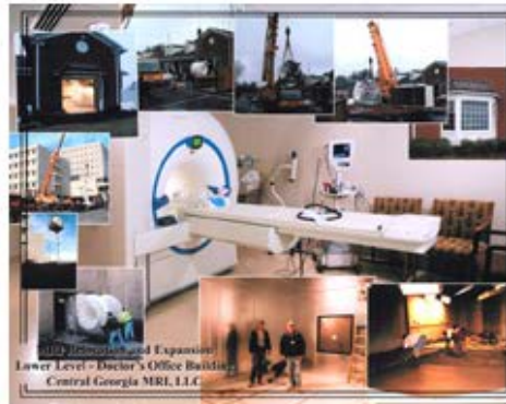
Warren Associates, Inc. MRI Relocation and Expansion Macon, GA