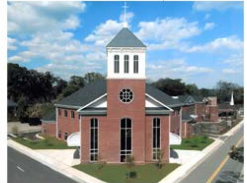
Van Winkle & Company, Inc. Zion Baptist Church Marietta, GA