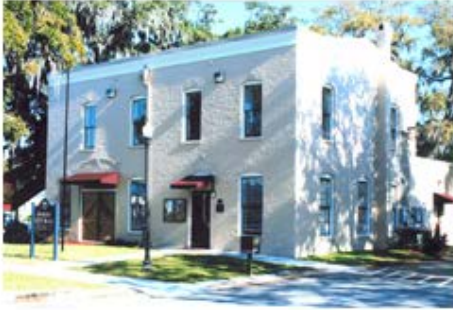
Allen & Graham, Inc. Historic City Hall Restoration Darien, GA