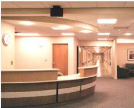
Cork-Howard Construction Co. Union General Hospital West Wing & LDR/C-Section Renovation Blairsville, GA