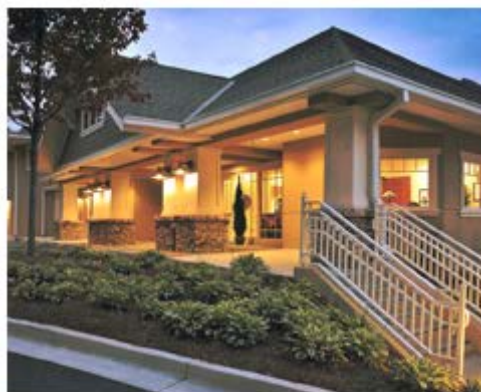
New South Construction Company, Inc. The Schenck School Renovation & Expansion Sandy Springs, GA