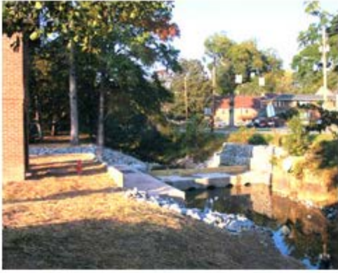
WWPS, Inc. Weracoba Creek Water Quality Improvement Project Columbus, GA