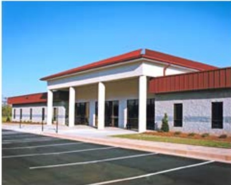
Stroud and Company Gresco Forsyth, GA