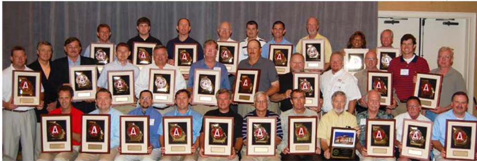
Pictured are representatives of projects awarded first place in the General Contractor Division of the AGC Georgia's 2008 Build Georgia Awards Program.

Each year a panel of industry professional select outstanding construction projects to receive the Build Georgia Award, and the Build Georgia Specialty Award, AGC Georgia's highest levels of distinction