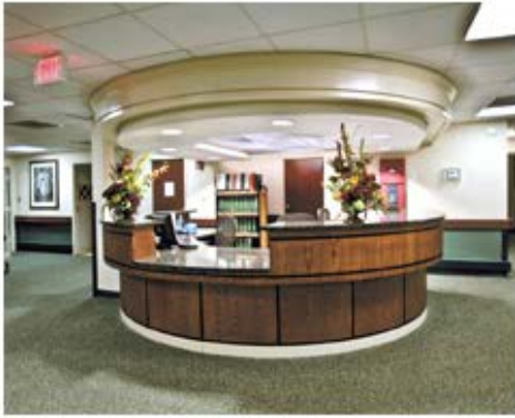
Rogers Construction Company Ashton Woods Rehabilitation Center Atlanta, GA

Also earned a Merit Award in the Best Sustainable Building Practices Division