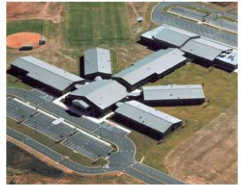
Bowen & Watson, Inc. Kings Bridge Middle School Athens, GA