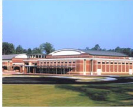
Barton Malow Company Renaissance Middle School Fairburn, GA Also earned a Merit Award in the Best Sustainable Building Practices Division