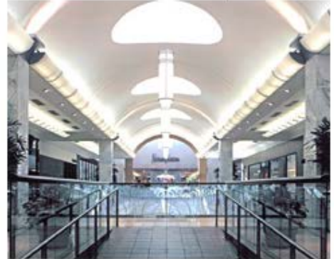
The Beck Group Lenox Square West Mall Overbuild Atlanta, GA