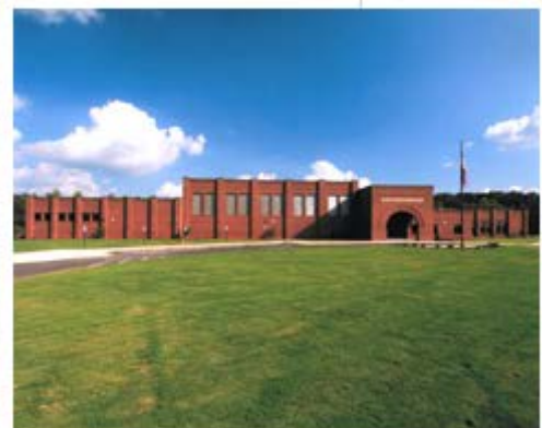
R.K. Redding Construction, Inc. Rockmart Middle School Rockmart, GA