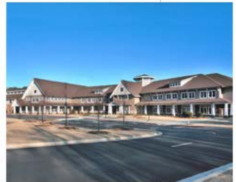
Brasfield & Gorrie, LLC King's Ridge Christian School Barbara Adler Academic Center Alpharetta, GA