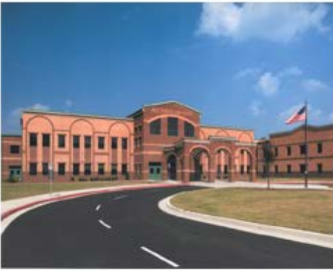
Gilbane Building Company West Forsyth High School Cumming, GA