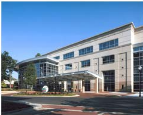
Brasfield & Gorrie, LLC Children's Healthcare of Atlanta at Egleston Atlanta, GA