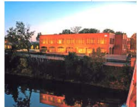
Piedmont Construction Group The Ice House Macon, GA Also earned a Merit Award in the Best Sustainable Building Practices Division