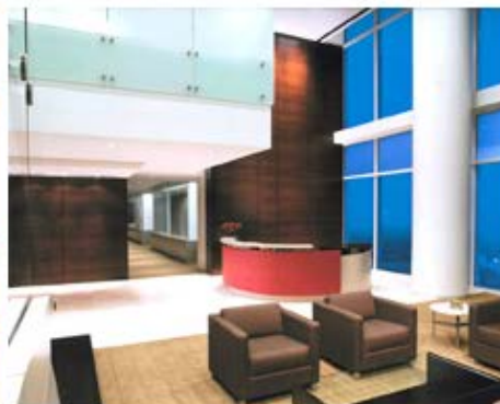
Cork-Howard Construction Co. Bain & Company Atlanta, GA