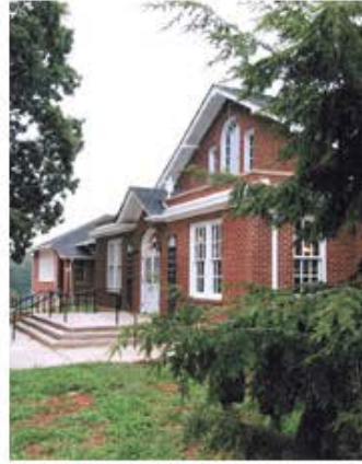
LUSK & Associates, Inc. Clarkston Community Center Clarkston, GA