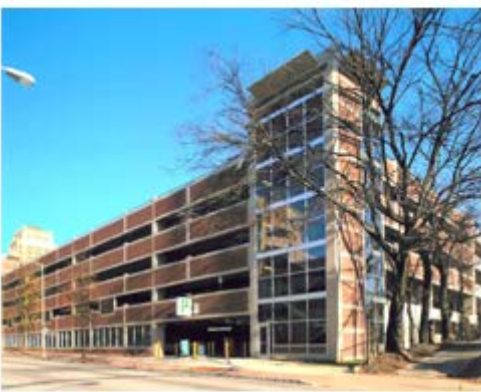
C. D. Moody Construction Company Downtown Parking Deck Atlanta, GA