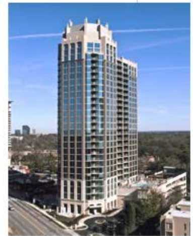
Manhattan Construction Company The Gallery Atlanta, GA