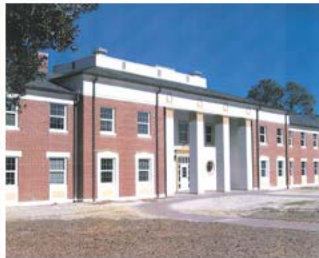
Garbutt/Christman A Joint Venture Partnership Cone Hall Renovation Statesboro, GA