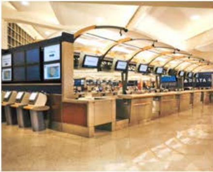
New South Construction Company, Inc. Delta Air Lines South Terminal Ticketing Renovation Atlanta, GA