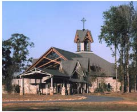
Headley Construction Corporation Christ the King Catholic Church Pine Mountain, GA