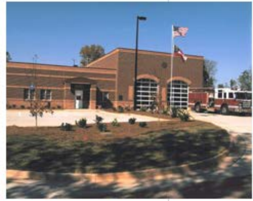
Hogan Construction Group, LLC. Douglas County Fire Station # 8 Villa Rica, GA