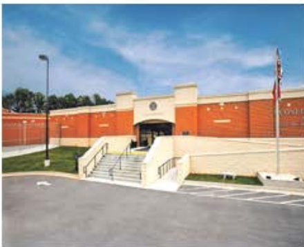
New South Construction Company, Inc. Oconee County Jail Watkinsville, GA