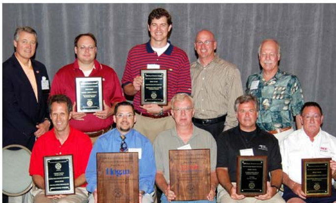
Pictured are representatives of projects awarded first place and merit awards in the Best Sustainable Building Practices Division of the AGC Georgia's 2008 Build Georgia Awards Program.