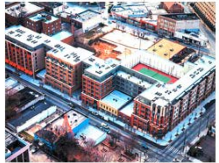
J.M. Wilkerson Construction Co., Inc. Renaissance Walk at Sweet Auburn Atlanta, GA