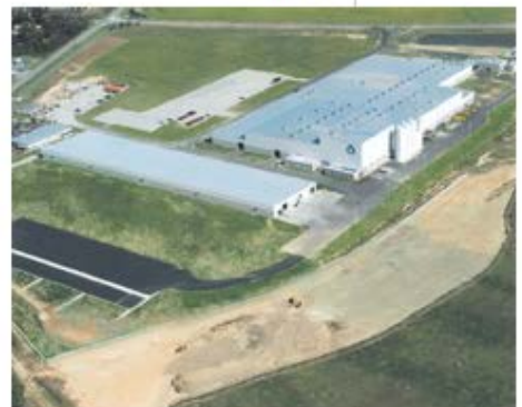
Kajima Building and Design Group Nichiha Macon, GA Also earned a Merit Award in the Best Sustainable Building Practices Division