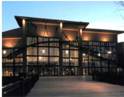
Van Winkle & Company, Inc. 12 Stone Church Lawrenceville, GA