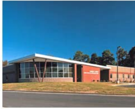
Rogers Construction Company Gwinnett County Animal Welfare and Enforcement Center Lawrenceville, GA

Also earned a Merit Award in the Best Sustainable Building Practices Division