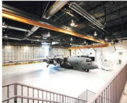
New South Construction Company, Inc. Dobbins ARB Maintenance Hangar Renovation Dobbins ARB, GA