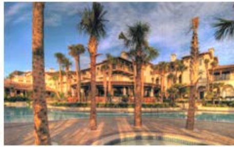
Batson-Cook Construction Sea Island Beach Club Sea Island, GA Also earned a Merit Award in the Best Sustainable Building Practices Division