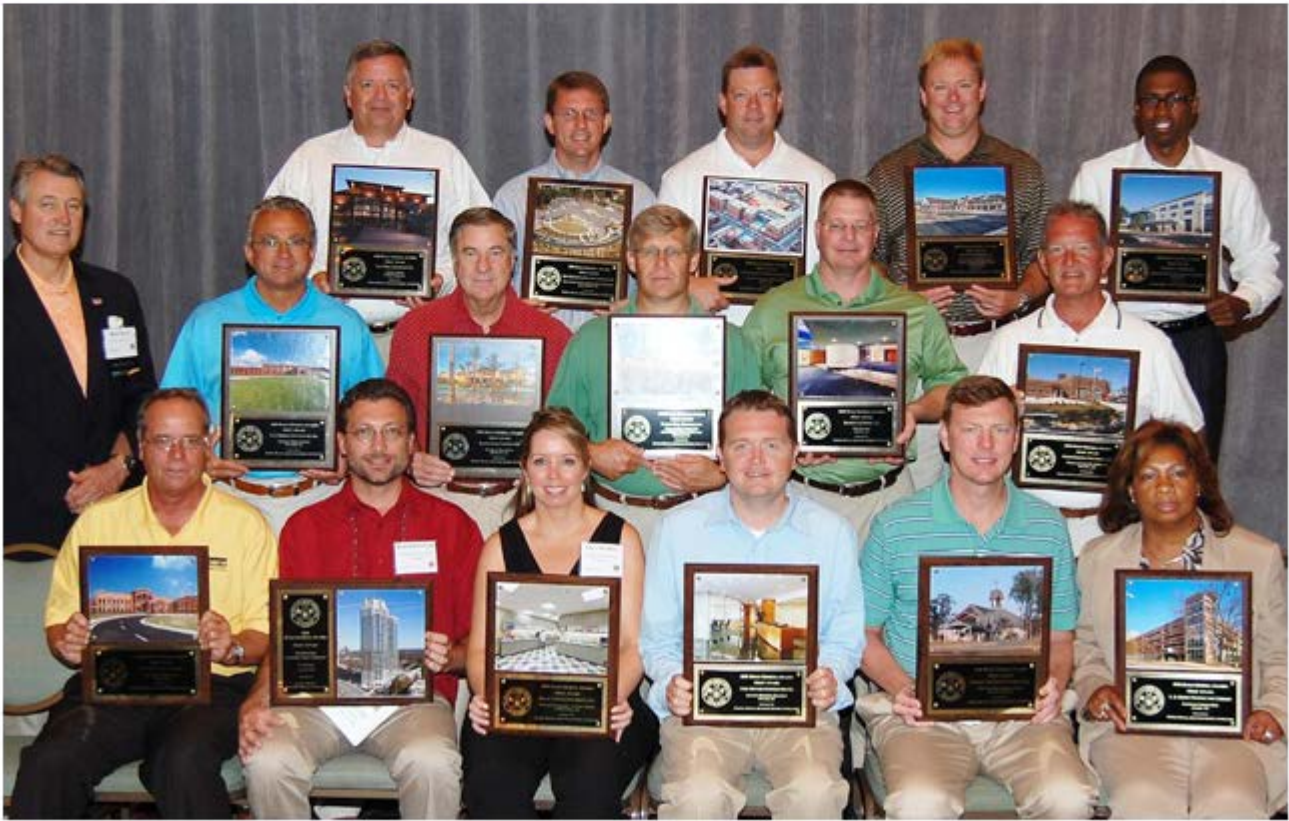
Pictured are representatives of projects earning Merit Awards in the General Contractor Division of the 2008 Build Georgia Awards Program.