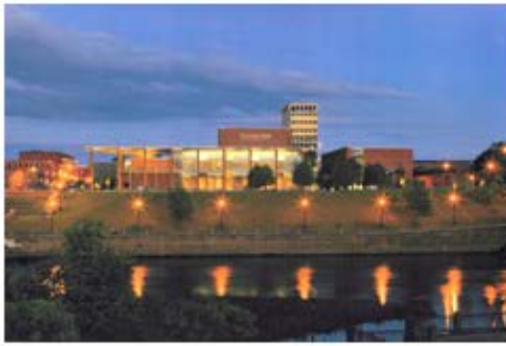
Batson-Cook Construction Columbus State University Corn Center for the Visual Arts Columbus, GA