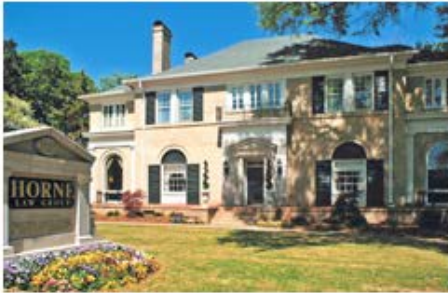
Stroud and Company Horne & Horne Macon, Georgia