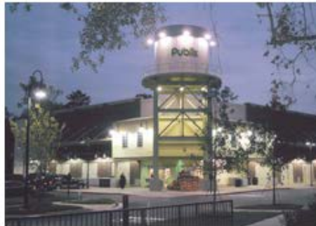
Young Contracting Company, Inc. Birmingham Village Alpharetta, Georgia