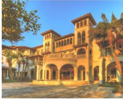
Batson-Cook Company Cloister Main Hotel Sea Island, Georgia