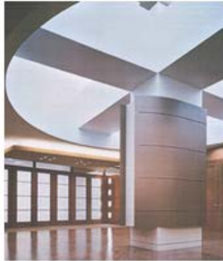
Turner Construction Company King & Spalding, LLP Atlanta, Georgia Also took First Place in the Best Sustainable Building Practices Division