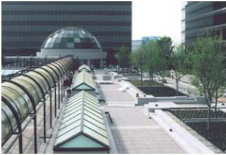
Hogan Construction Group, LLC Northpark 500 Roof Garden Atlanta, Georgia