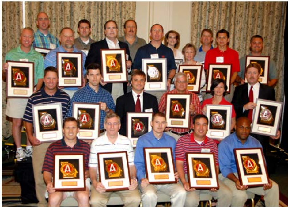
Pictured are Representatives of projects that were awarded first place in the General Contractor Division of the AGC Georgia's 2007 Build Georgia Awards Program.

Each year a panel of industry professional select outstanding construction projects to receive the Build Georgia Award, and the Build Georgia Specialty Award, AGC Georgia's highest levels of distinction