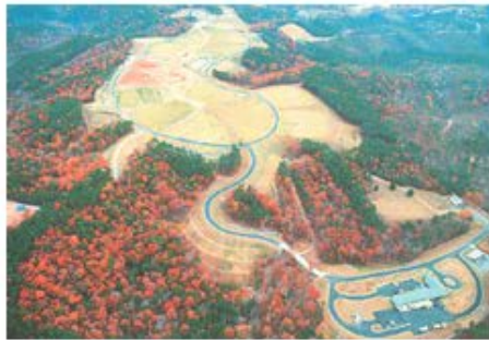
J. M. Wilkerson Construction Company, Inc. Georgia National Cemetary Canton, Georgia