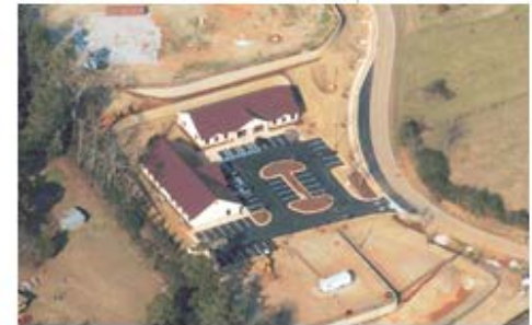
Collins & Company The Village at Pinnacle Pointe Buford, Georgia