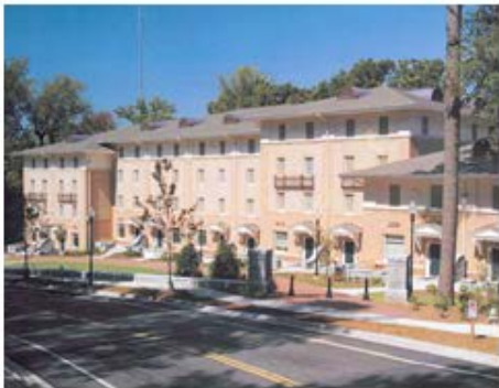
New South Construction Company, Inc. Emory University Sorority Housing Complex Atlanta, Georgia Also took Honorable Mention in the Best Sustainable Building Practices Division