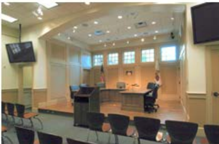
Van Winkle & Company, Inc. Decatur City Hall Decatur, Georgia