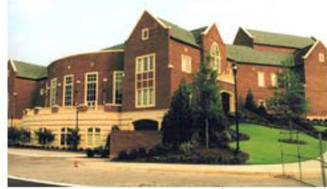
R. J. Griffin & Company Dozie Centre for the Performing Arts Kennesaw, Georgia