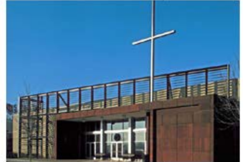
The Beck Group His Hands Church Woodstock, Georgia Also took Honorable Mention in the Best Sustainable Building Practices Division