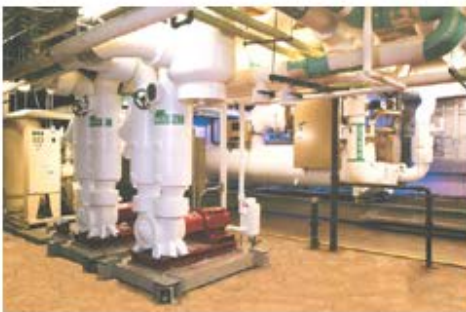
Cork-Howard Construction Company, Inc. DeKalb Medical Center - Chiller Replacement Decatur, Georgia