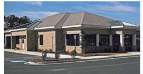
Stroud and Company Lisenby Orthodontics Macon, Georgia