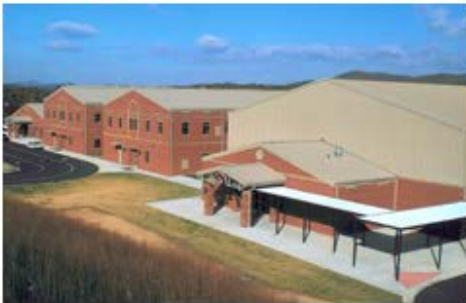
Bowen & Watson, Inc. Union County Middle School Blairsville, Georgia