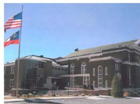
New South Construction Company, Inc. Canton City Hall Canton, Georgia