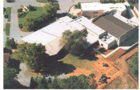
LUSK & Associates, Inc. Holy Family Catholic Church; Parish Hall Marietta, Georgia