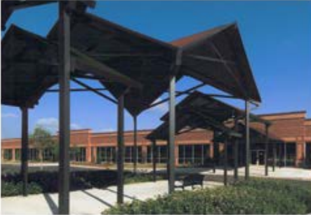
Freese Constructin Company, Inc. Sage Software Regional Corporate Headquarters Lawrenceville, Georgia