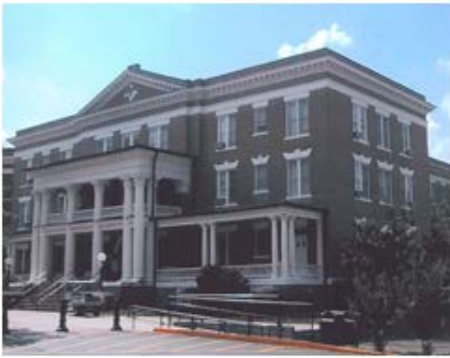
Garbutt Construction Company, The Christman Company, A Joint Venture Bell Hall Milledgeville, Georgia