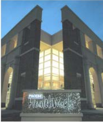
Alcon Associates, Inc. Healthworks Employee Wellness and Fitness Center Albany, Georgia