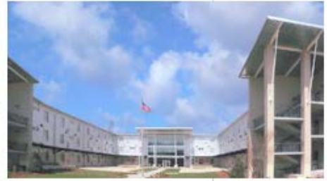
Chris R. Sheridan & Company Georgia Military College Barracks Milledgeville, Georgia