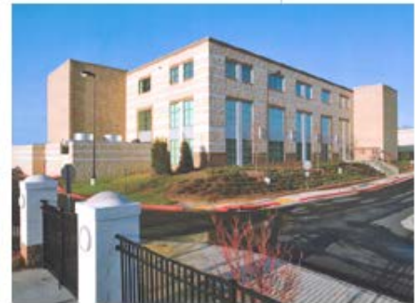
New South Construction Company, Inc. The Doris and Alex Weber Jewish Community High School Sandy Springs, Georgia