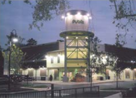
Cooper & Company General Contractors, Inc. Bethesda Park Expansion Lawrenceville, Georgia