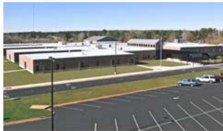
Rogers Construction Company Monroe Elementary School Monroe, Georgia