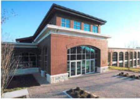
Rogers Construction Company Corporate Office Building for Jackson EMC Jackson, Georgia