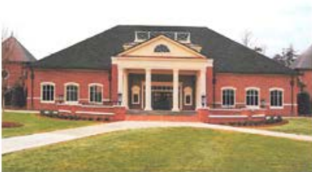
New South Construction Company, Inc. Wesleyan School Athletics Building Norcross, Georgia