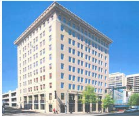
Holder Construction Group, LLC The Glenn Hotel Atlanta, Georgia