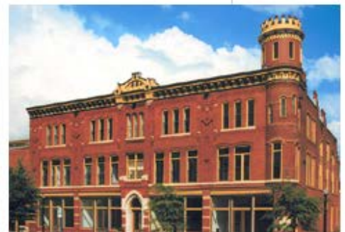
Garbutt Construction Company Restoration and Renovation of the Macon Volunteers Army Macon, Georgia