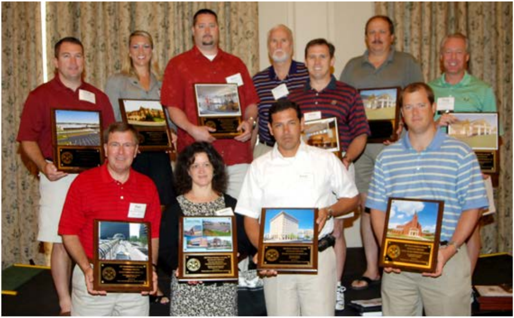
Pictured are representatives of projects that were awarded Honorable Mention in the General Contractor Division of the 2007 Build Georgia Awards Program.