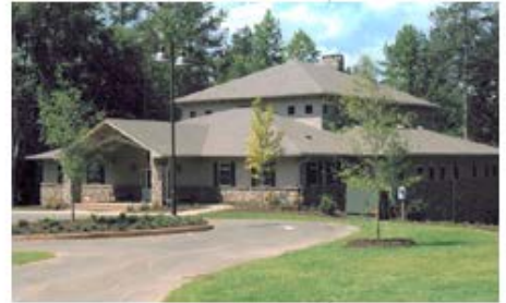
Van Winkle & Company, Inc. Eagle Ranch - Central Campus Building Chestnut Mountain, Georgia