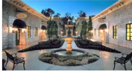
Integrity Development Group, Inc. Integrity Heights at Highlands Smyrna, Georgia