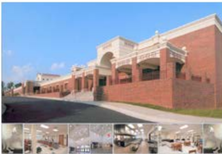
Nix-Fowler Constructors, Inc. Ronald McNair High School Atlanta, Georgia