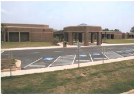
Manhattan Construction Company Ola High and Middle Complex McDonough, Georgia