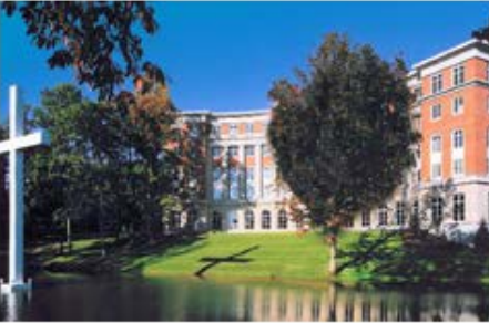
Brasfield & Gorrie, LLC Georgia Baptist Convention Duluth, Georgia