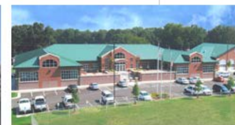
The Potts Company Forsyth County Public Safety Complex Cumming, Georgia