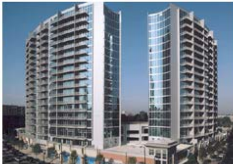
Brasfield & Gorrie, LLC Plaza Midtown Atlanta, Georgia