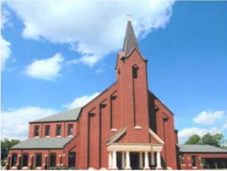
Carroll Daniel Construction Company St. John Baptist Church Gainesville, Georgia