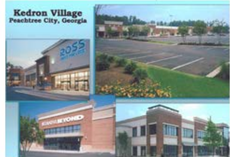
Collins and Arnold Construction Company, LLC Kedron Village Expansion Peachtree City, Georgia