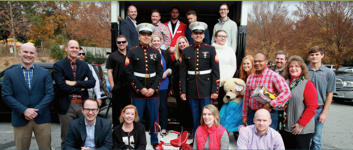
YLP participates annually in the Toys for Tots Drive , sponsored by the Marine Corps. AGC Georgia members have donated thousands of toys in the past decade and have enthusiastically support the project.