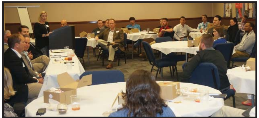
Members serving on YLP’s Council and with the Education Area of Focus (see next page) lead efforts to plan the program’s robust professional development curriculum.

YLP member annual dues support and underwrite most YLP activities throughout the year.