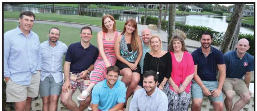
YLP members participate each year in AGC Georgia's Annual Convention. This group participated in the convention at Ponte Vedra Club & Inn in June 2017.

YLP is An Investment in Your Future Join or Renew Your Membership in YLP