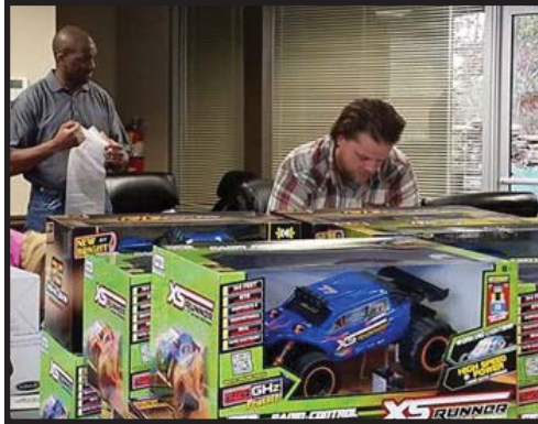
Members proudly take ownership of contributing holiday gifts to 80 children at Hillside Hospital. They also encourage firms to contribute to Toys for Tots.

The program relies heavily on YLP members volunteering their time, talents and energy working together with Council members to implement YLP activities and the ongoing YLP Action Plan. This plan is designed to ensure the quality growth of the program and an outstanding experience for all YLP participants.