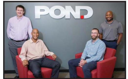
Consider enrolling several team members in YLP and sharing this industry participation with clients and project team members in your company newsletter!