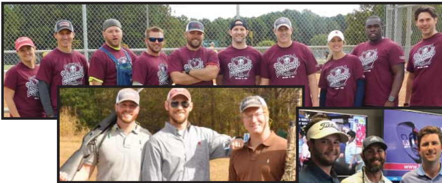
Coordinating our Sporting Clays Tournament & Golf Classic, and participating in CEFGA's kickball tournament are great ways to meet other young professionals.