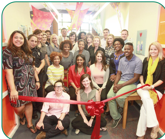
Members donate their time to assist local charities.

In 2015, members worked with crews to increase the size of an interview room, add walls to the deck with acoustical sealant for soundproofing, re-wrap fabric panels, paint, place new floor and baseboards and provide new furniture and light fixtures at the Georgia Center for Childhood Advocacy in the Grant Park neighborhood.