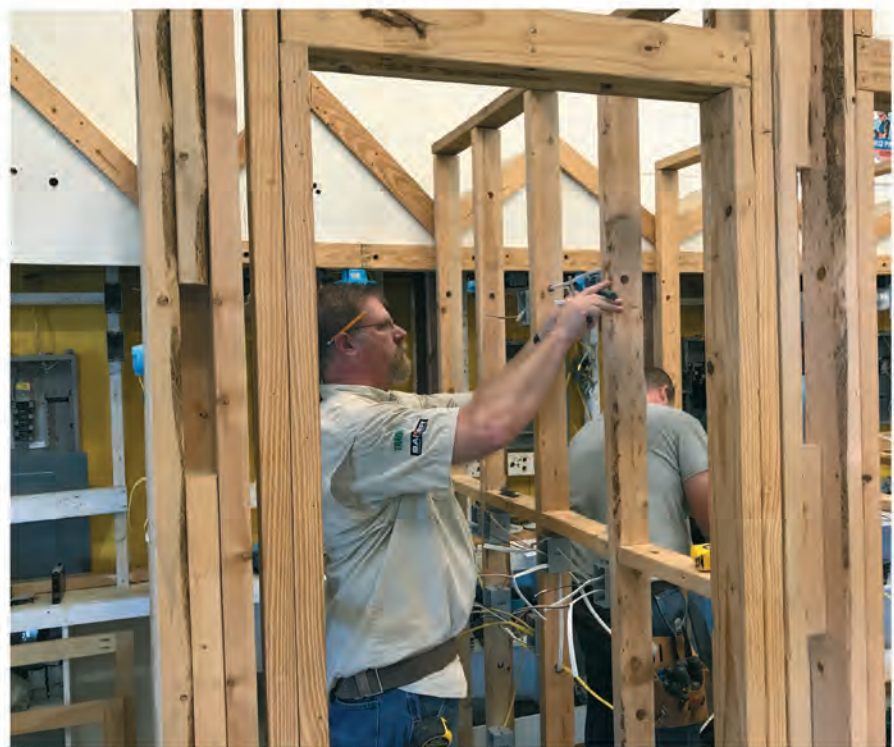
Construction teachers participate in Camp T & I each summer to fine tune their skills. Industry professionals help lead the workshops to make sure teachers are using current best practices in their curriculum.

Tulsa Welding School, based in Jacksonville, manages the welding competition for this region's competition. The South+Southwest Alliance is also fortunate to have members that go above and beyond. TTL, MetroPower, ACE Electric and A. West Enterprise attend almost every meeting and do the hard work onsite to make this event possible, as well as set up their own booths, help with registration and provide competition judges.