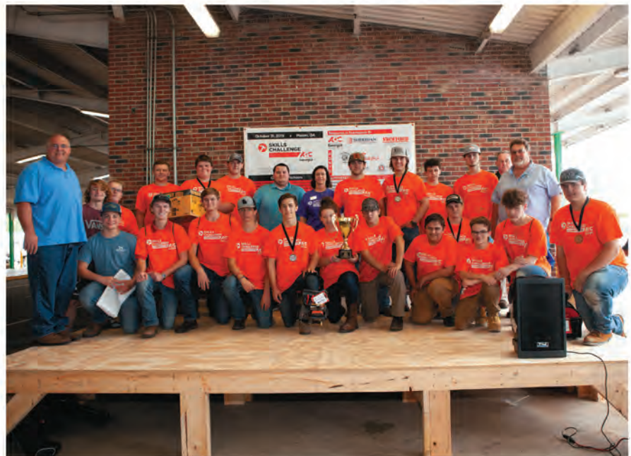
Camden County celebrates winning the Construction Cup at the 2019 Central Georgia/Southern Crescent Skills Challenge. All stakeholders in the event were appreciative of Mary Persons High School students for volunteering to build the stage for the annual gathering.

The Alliance targeted middle and high school students for its daylong event. Construction industry vendors set up booths, while some provided hands-on experiences for students and, most importantly, introduced them to the world of construction.