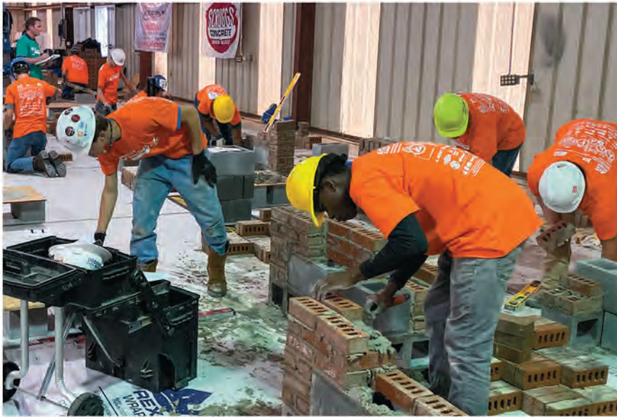
In just the third year of hosting a Skills Challenge in Moultrie, the regional event now has the most student competitors of all regions. The 2019 event coordinated events for 250 competitors.