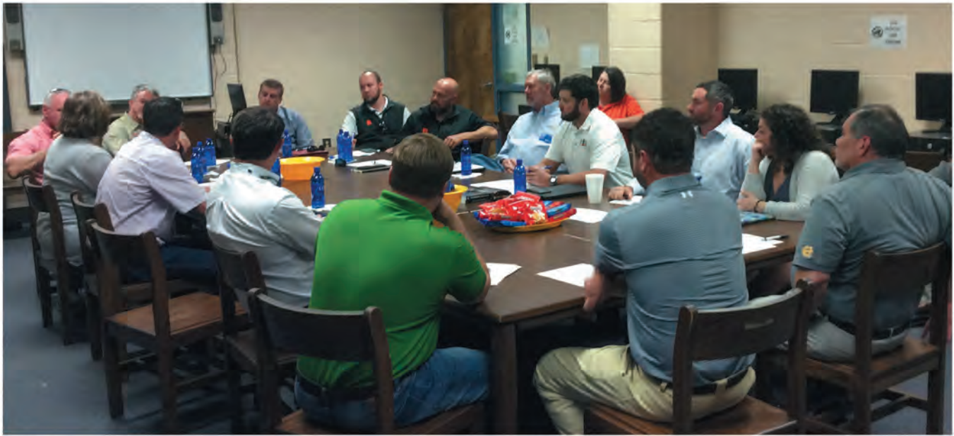
Representatives with the construction industry meet with Harris County School's leadership to re-establish their construction program.