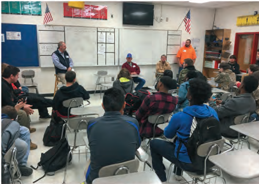
Students at Spalding High School participate in a panel discussion with three veteran construction jobsite field professionals to learn about their career paths.