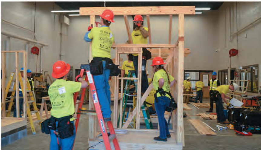
Four students represent their school in the TeamWorks competition at the 2019 Northwest Georgia Skills Challenge.