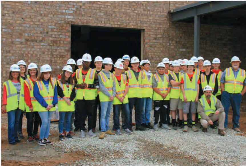
Bowen & Watson hosted a jobsite tour for students from Stephens County High School.