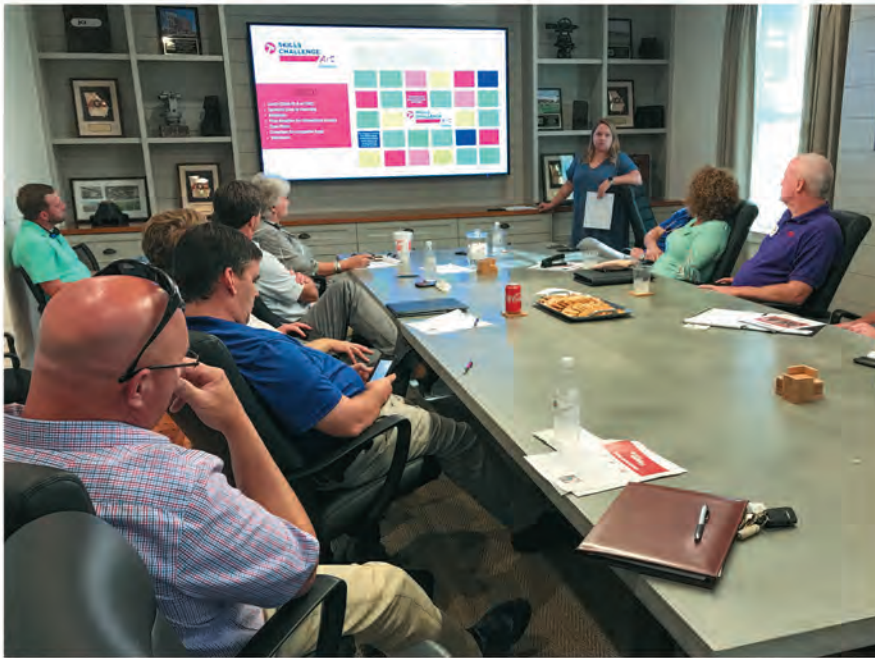
Leaders from the South+Southwest Workforce Development Alliance meet at JCI Contractors to plan the annual Skills Challenge.