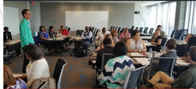
Counselors learning about potential careers in the construction industry at Holder Construction