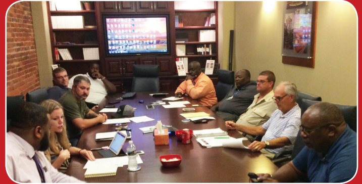
The East Georgia Workforce Development Alliance met September 14 at the RW Allen office in Augusta.