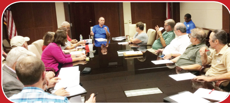
On September 26, the Southern Crescent and Central Workforce Development Alliances met.