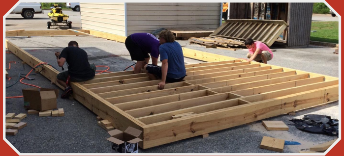
Lumpkin County students work on a Habitat for Humanity home.