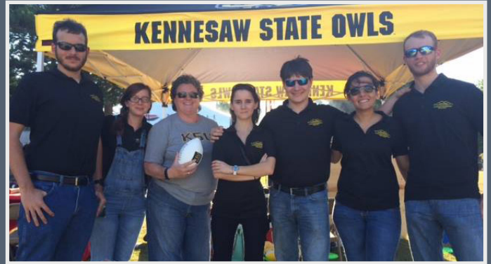
Kennesaw State CM program held a Welcome Cookout for new students.