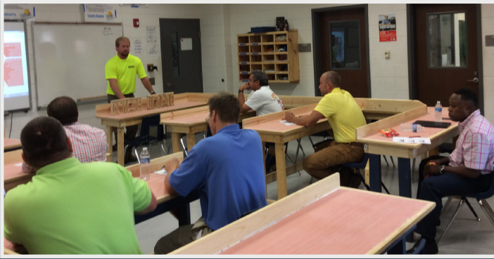
Statesboro High School Advisory Committee discusses plans for current school year.