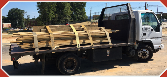
Collins and Arnold Construction Co. provided lumber from a wood bridge project to students at Roswell High School.