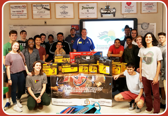
Georgia Trade School delivers tools and supplies to Kennesaw Mountain High School.