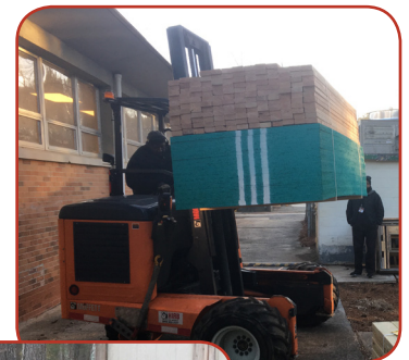
Warren Technical School receives a truck load of lumber from McCarthy Building Companies, Inc.