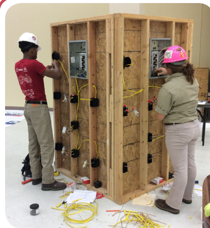
Region 6 students compete at Oconee Fall Line Technical College in electrical (l) and carpentry (bottom).