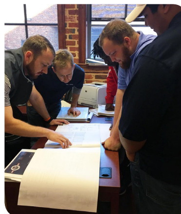
Students from Hephzibah High School participated in National Job Shadow Day at the R. W. Allen, LLC Augusta office.