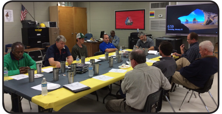
The East and West Laurens High Schools Advisory Committee meets to provide industry support for the construction programs.