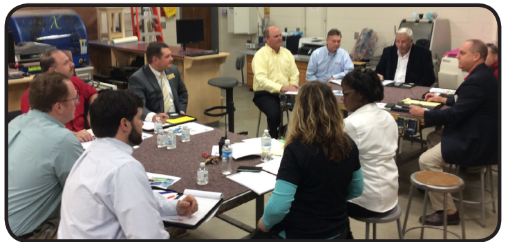
An exploratory meeting is held to discuss the construction program at Houston County College and Career Academy.