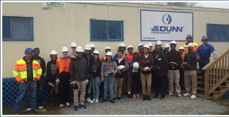
JE Dunn Construction took Windsor Forest High School construction students on a local jobsite tour.