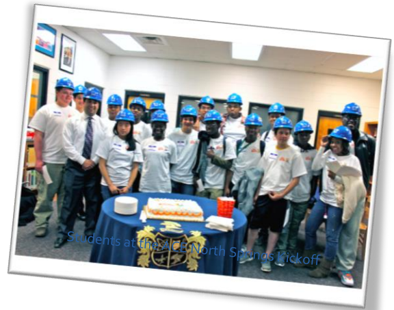
Students at the ACE North Springs Kickoff

The North Springs program, headed by Holder's Amy Tribo, is the pilot for a new ACE Atlanta model bringing skilled trades/craft focused education to schools lacking accredited construction education programs. The program is just one area of focus for the ACE Mentor Program established by Holder Construction in 2005.