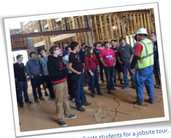
Swofford Construction hosts students for a jobsite tour.

students on a tour. He stressed the importance of safety and shared many of the challenges the crew faced with the site work, utilities, and the building's exterior. He also discussed the construction management process and value engineering.