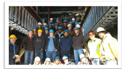
Camden County High School students visit with Elkins Construction, LLC in Brunswick.