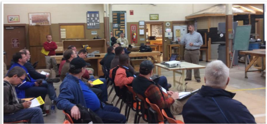
Trade & Industrial Educators of Georgia (TIEGA) Winter Conference - January 2015