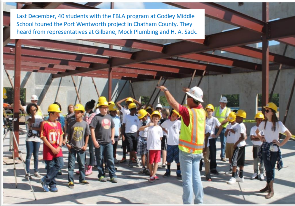
Last December, 40 students with the FBLA program at Godley Middle School toured the Port Wentworth project in Chatham County. They heard from representatives at Gilbane, Mock Plumbing and H. A. Sack.