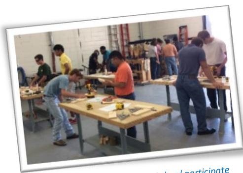
Students at Statesboro High School participate in the construction pathway.