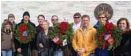
During the holiday season, members participating in the Chapter's Young Leadership Program joined with thousands of others across the nation to lay wreaths at veterans' gravesites to honor those who have lost their lives serving our country.

As in previous years, Georgia Branch, AGC relies on members of the Young Leadership Program (YLP) to raise funds for worthy organizations and charitable groups. This is done primarily through an annual golf tournament each May and in 2009, raised a total of $60,300 for a cumulative fundraising total of $443,000 over the last 10 years. Annual recipients of these funds