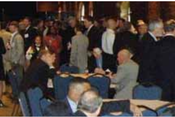
Georgia Branch, AGC together with AIA and ACEC host the annual Building Georgia Legislative Reception so our respective members can meet with legislators and other elected government officials, and regulatory agency personnel in an informal setting to get better acquainted with each other.

"As a specialty contractor, we continue to benefit from our association with AGC. Our company has developed strong relationships with many of the general contractors who are AGC members. We appreciate the Chapter's efforts to encourage and promote the benefits of members working with other members."