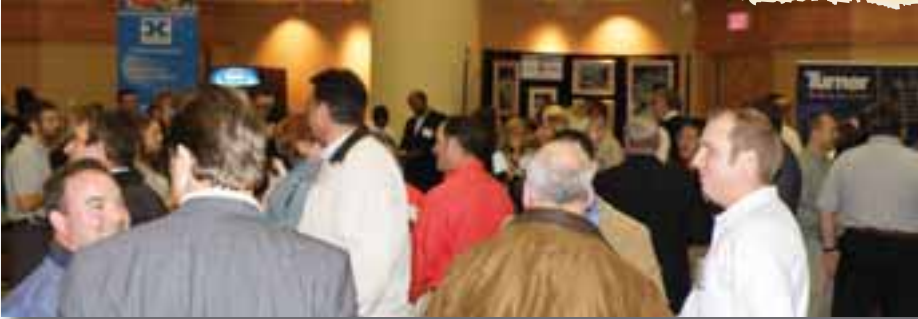
Always a well attended and popular event, the annual Contacts for Contracts program features a General Contractor Marketplace where general contractors promote their respective companies and make contacts with specialty contractors, suppliers and service providers.