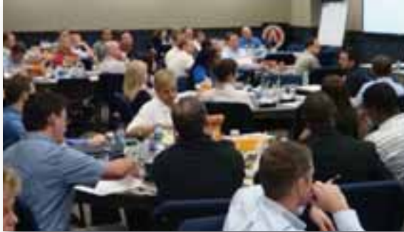
The Chapter's Young Leadership Program hosted a very successful roundtable discussion for their members and the membership-at-large to hear from several respected industry executives about their construction career experience and secrets to success.

The Chapter's Young Leadership Program (YLP) has grown considerably since its start in 1996, and this past year is no exception. The program originally operated in Atlanta, and recently expanded to Macon, Savannah and Columbus.