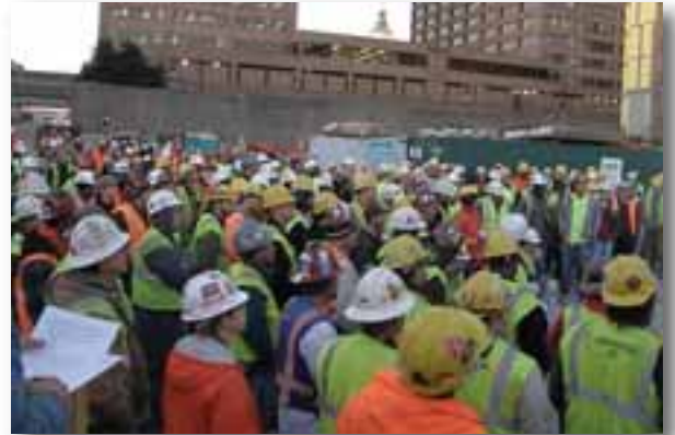
Jobsites across Georgia shut down their projects at the same time during the Chapter's two industry-wide safety stand downs to focus field personnel on enhanced safety awareness and best practices in crane safety and fall protection.

The Chapter launched its first two highly successful Safety Stand Downs in August 2008 and February 2009 attracting approximately 47,000 participants. During both of the stand downs, over 120 member and non-member general and specialty contractors agreed to shut down 857 jobsites for up to one hour all at the same designated time to focus their respective field personnel on a single safety topic. The first stand down addressed best practices in crane safety to minimize or eliminate crane accidents from occurring in Georgia similar to what was happening in other states. The second stand down featured fall protection. The Chapter's very active and dynamic Safety and Health Committee played a major role in the stand downs success. In addition, several member firms took a leadership role making sure these stand downs were successful and publicized to a larger audience. This helped the Chapter and industry focus positive attention on the safety measures we are taking to insure a safe workforce. These stand downs have had a direct positive impact on our industry's image and reputation which influences young people to pursue construction as their career choice.