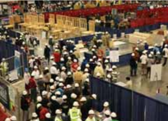
High school and vocational school students together with school faculty, Chapter members and industry leaders were on hand during CEFGA's annual Career Expo which drew more than 6,000 attendees.

"While it is so easy to get immersed in the current economic situation and the toll it is taking on the construction industry, I appreciate AGC's efforts to stay focused on the future by your continuing to prioritize workforce development efforts and offer classes to enhance our knowledge of BIM technologies and LEED practices. We want to be ready when the economy turns for the better and construction is back in full swing so these opportunities are important for our company to participate in now."