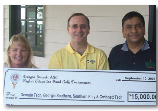
Student scholarships and construction department needs at Georgia colleges are supported by members who take part in the Chapter's Higher Education Fund Golf Tournament.

hrough Georgia Branch, AGC's extensive involvement with the state's collegiate construction management programs, we continue to build strong ties with students active in AGC Student Chapters. Chapter members and staff also bring an influential voice to many local construction management programs by serving on advisory boards for Southern Polytechnic State University, Georgia Institute of Technology, Georgia Southern University and Gwinnett Technical College. Monies raised by the Chapter's annual Higher Education Fund Golf Tournament provide student scholarships and funds for special needs identified by faculty at these schools.