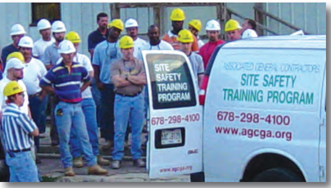
Convenient training options are available for members in both classroom and jobsite settings.

afety is a top priority for Chapter members and Georgia Branch, AGC. Many Chapter's resources are dedicated to assisting member firms with classroom safety education, jobsite safety training, and general safety support. Safety specialists employed by the Chapter deliver safety services and training to member jobsites via safety vans, and their safety knowledge is especially valued by the most experienced safety personnel.