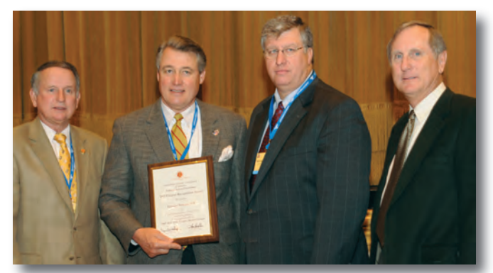
AGC of America recognizes Georgia Branch, AGC for its award-winning support of AGC PAC.

In Georgia's election cycle, Georgia Branch, AGC PAC allows us to participate in nearly 150 House, Senate and Statewide campaigns in order to help elect probusiness, pro-construction legislators. At the federal level, our Chapter's outstanding fundraising efforts were recognized in March by our national organization. We won AGC of America's PAC award for 100% participation by Chapter Board members and received recognition for having the largest single dollar amount by any Board of all AGC Chapters. Georgia Branch, AGC was also honored because our members donated the 5th largest dollar amount of all 50 states to AGC of America's PAC.