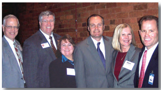
Industry leaders with AIA, ACEC and AGC meet with Lt. Governor Cagle at a joint legislative reception.