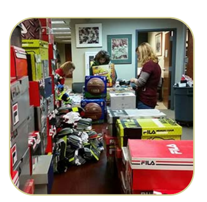
Members donate their time to assist local charities.

(top) Toys are collected at the Annual YLP Holiday Lunch for the Toys for Tots program.