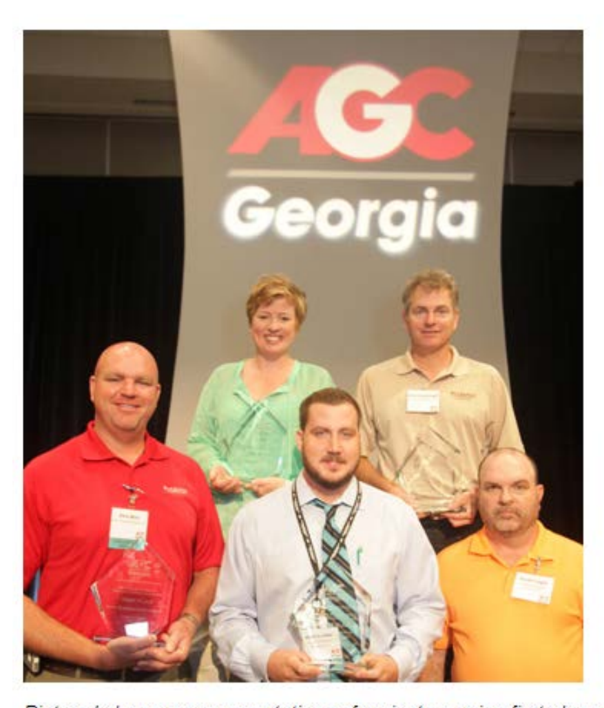
Pictured above are representatives of projects earning first place in the Specialty Contractor Division of the AGC Georgia's 2013 Build Georgia Awai

Each year a panel of industry professional select outstanding construction projects to receive the Build Georgia Award, and the Build Georgia Specialty Award, AGC Georgia's highest levels of distinction