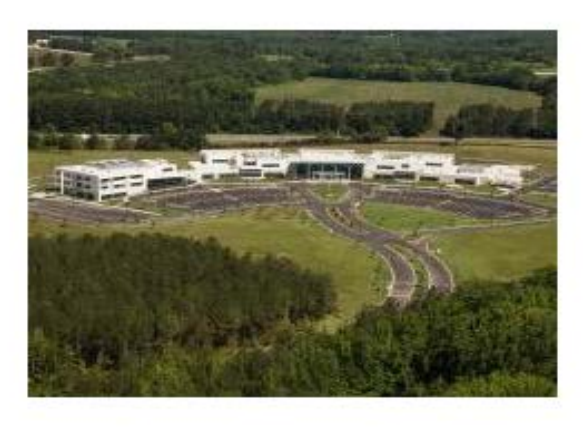
Rawlins Mechanical Contractors, Inc. Ty Cobb Regional Medical Center Lavonia