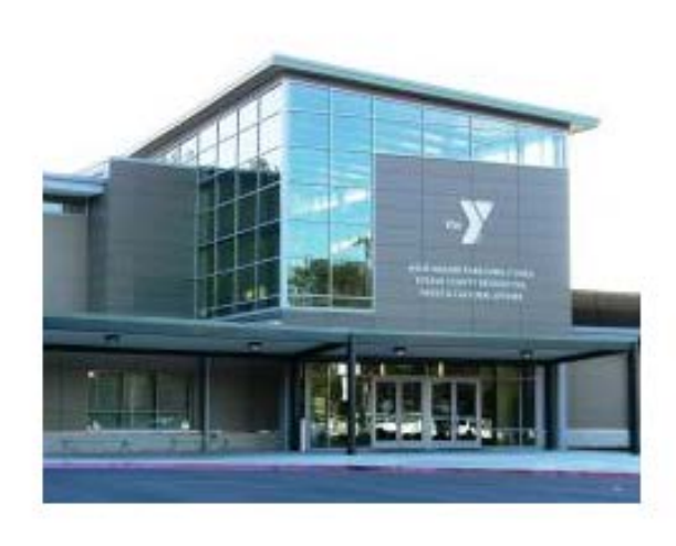
Taylor Commercial, Inc. Wade Walker Park Multi-Purpose Aquatic Center Stone Mountain