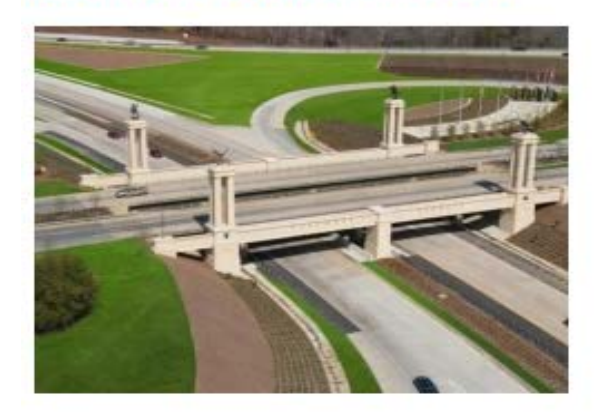
Athena Construction Group The New Gateway to Fort Benning Columbus