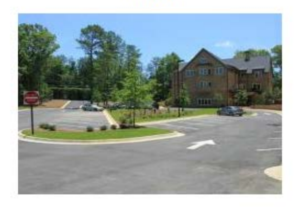
Brent Scarbrough & Company, Inc. Holy Innocents Episcopal School Atlanta