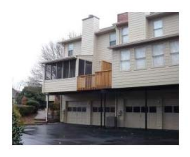
Taylor Commercial, Inc. Windsor Trace Condominiums Norcross