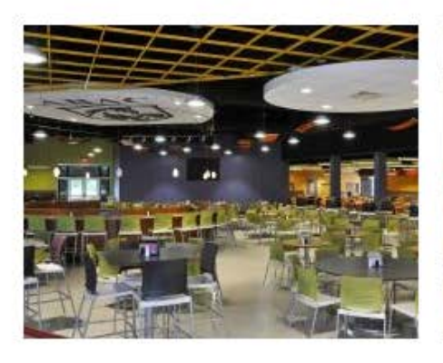
Parrish Construction Group Donaldson Dining Hall at ABAC Tifton