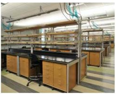
Hogan Construction Group, LLC University of Georgia - Boyd Graduate Studies Building - 7th Floor Renovation Athens* Also earned First Place in Best Sustainable Building Practices Division