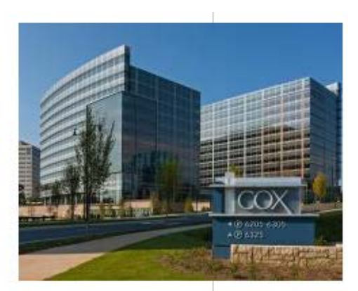
Holder Construction Company Cox C-Tech Office Building Atlanta Also earned First Place in Best Sustainable Building Practices Division