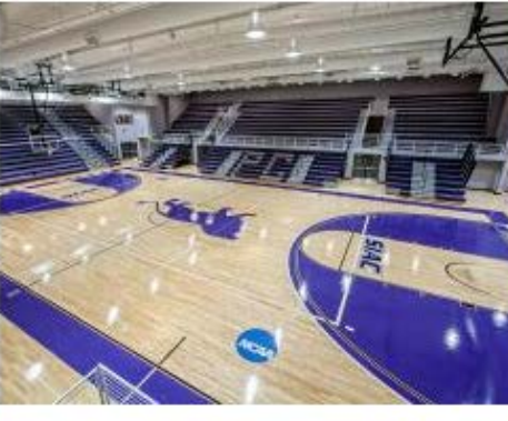
R.W. Allen, LLC Paine College HEAL Center Augusta