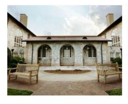
Holder Construction Company Emory University Dobbs Hall Renovation Atlanta Also earned First Place in

Best Sustainable Building Practices Division