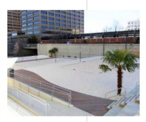
New South Construction Company Georgia State University, Sports Arena -Outdoor Sand Volleyball Courts Atlanta