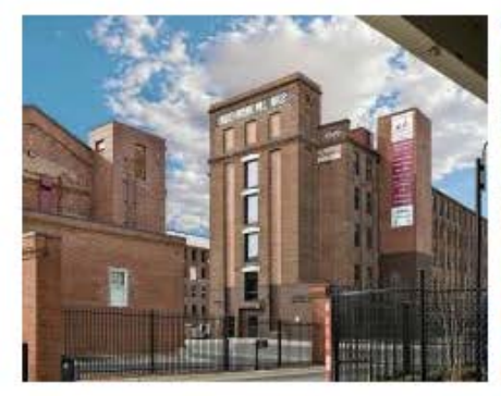
Brasfield & Gorrie Eagle & Phenix Mill No. 2 Renovation Columbus Also earned First Place in Best Sustainable Building Practices Division