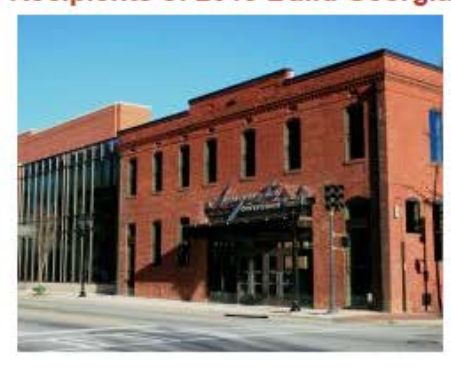
R.W. Allen, LLC Augusta Trade, Exhibit & Event (TEE) Center Augusta