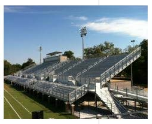
Parrish Construction Group "The Brickyard" at Thomson High School, McDuffie County Schools Thomson