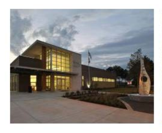
Hogan Construction Group, LLC Suwanee Police Substation and Training Suwanee