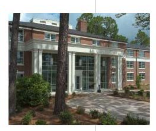
Garbutt I Christman, LLC The Rehabilitation of Brannen Hall Statesboro