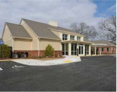
Hogan Construction Group / Bryson Constructors Joint Venture Oak Hill Child, Adolescent and Family Center Atlanta