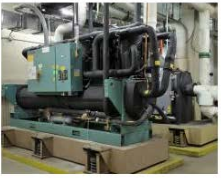
Parrish Construction Group HVAC Renovation - Atlanta Technical College Atlanta