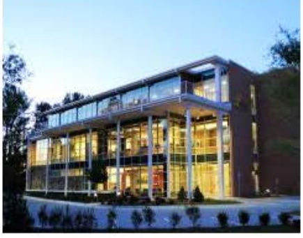
Choate Construction Company Palmetto Health Council Medical Office Building Palmetto Also earned First Place in Best Sustainable Building Practices Division