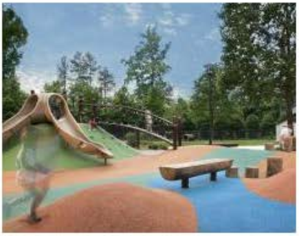
Brasfield & Gorrie Newell Rubbermaid Childcare Center Sandy Springs Also earned First Place in Best Sustainable Building Practices Division