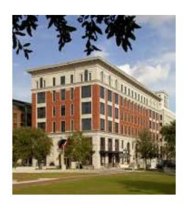
New South Construction Company The Cay Building Savannah