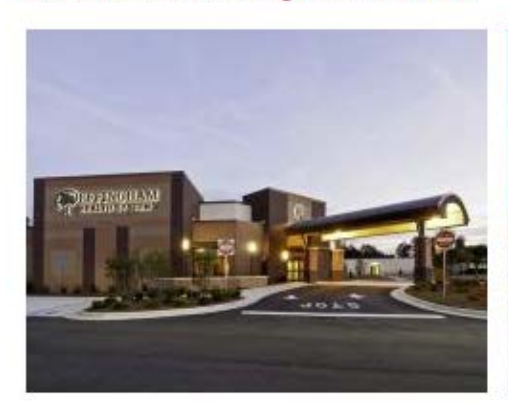
JE Dunn Construction Company Effingham Hospital Springfield