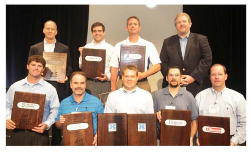
Pictured above are representatives of projects awarded first place in the Best Sustainable Building Practices division of AGC Georgia's 2013 Build Georgia Awards Program.