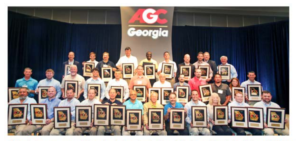
Pictured above are representatives of projects earning first place in the General Contractor division of AGC Georgia's 2013 Build Georgia Awards Program.

Each year a panel of industry professional select outstanding construction projects to receive the Build Georgia Award, and the Build Georgia Specialty Award, AGC Georgia's highest levels of distinction