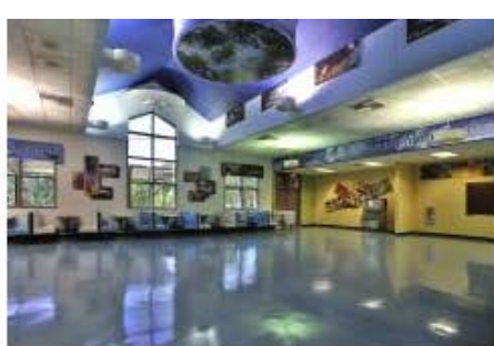
Parrish Construction Group Carter Elementary School & Brookdale Elementary School Macon

Also earned First Place in Best Sustainable Building Practices Division