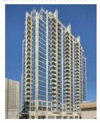
SkyHouse - Midtown Atlanta Also earned Merit Honors in the Best Sustainable Building Practices Division