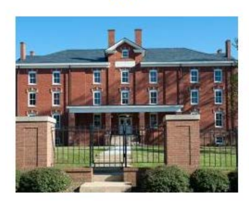
Garbutt Construction Company The Rehabilitation of Huntington Hall Fort ∀alley