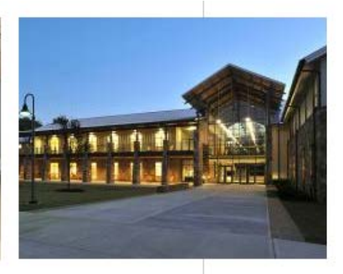
Van Winkle Construction Whitefield Academy Upper School Mableton