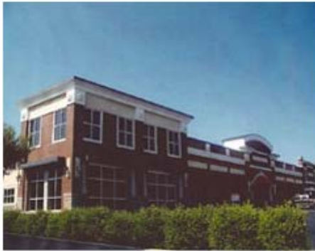
JBrennon Construction, Inc. Main Street Village Cartersville