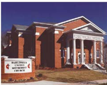
LUSK & Company Inc. Dahlonaga United Methodist Church Dahlonaga Also took a Merit Award in the Best Sustainable Building Practices Division