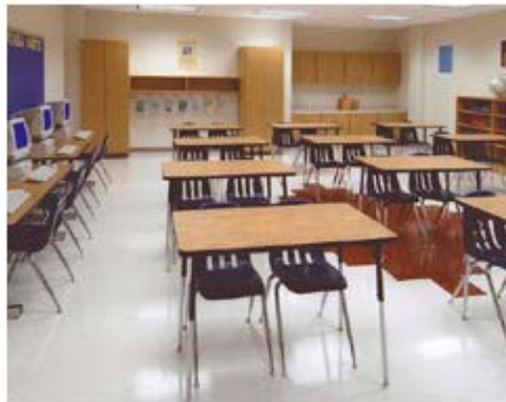
R.J. Griffin & Company Fickett Elementary School Remodel Atlanta