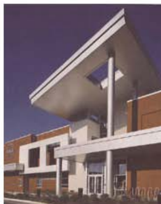
Choate Construction Company - Savannah Live Oak Public Library, Southwest Branch Savannah Also took a Merit Award in the Best Sustainable Building Practices Division