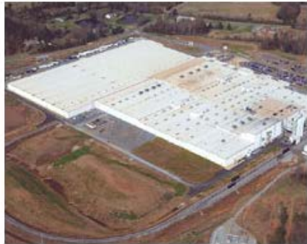
Kajima Building & Design Group, Inc. Toyo Tire Manufacturing Facility, Phase III White