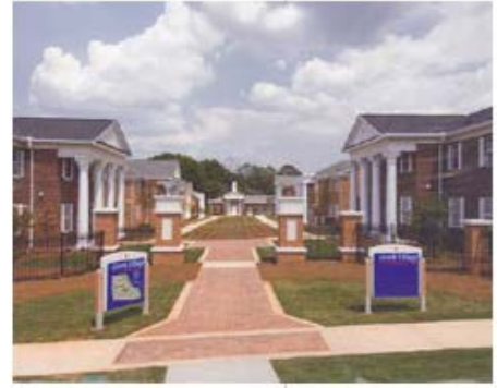
R.K. Redding Construction, Inc. Greek Village, University of West Georgia Carrollton