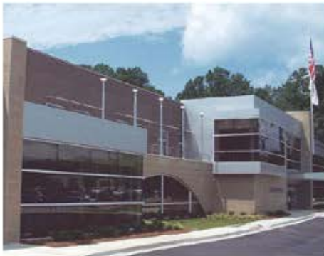
Stroud & Company OrthoGeorgia Properties Macon