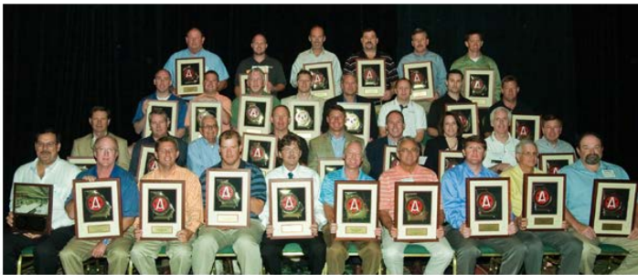
Pictured are representatives of projects earning first place in the General Contractor division of AGC Georgia's 2010 Build Georgia Awards Program.

Each year a panel of industry professional select outstanding construction projects to receive the Build Georgia Award, and the Build Georgia Specialty Award, AGC Georgia's highest levels of distinction