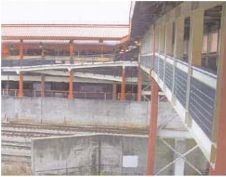
Cooper & Company General Contractors, Inc. MARTA - Lakewood, Ft. McPherson Atlanta