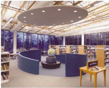
Hogan Construction Group, LLC Avis G. Williams Toco Hill Branch Library Decatur