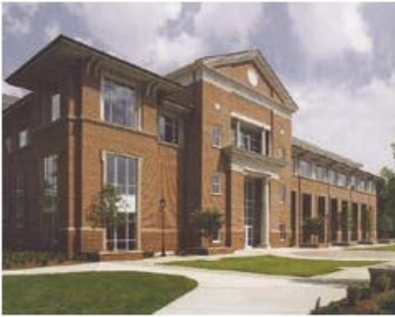
Holder Construction Company Tate Student Center Expansion at the University of Georgia Athens

Also took a Merit Award in the Best Sustainable Building Practices Division