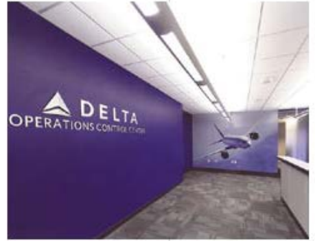
New South Construction Co., Inc. Delta-Operation Control Center, Renovation Atlanta