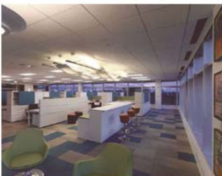
New South Construction Company Delta Community Credit Union Vinings Branch Atlanta