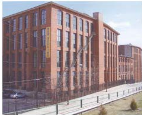
Gay Construction Company Fulton Cotton Mill Tornado Recovery Project Atlanta