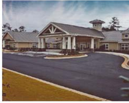
Premier Construction Associates, LLC Benton House of Newnan Lakes Newnan