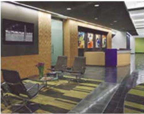
Batson-Cook Company IDI Corporate Headquarters - Interior Buildout Atlanta Also took First Place in the Best Sustainable Building Practices Division