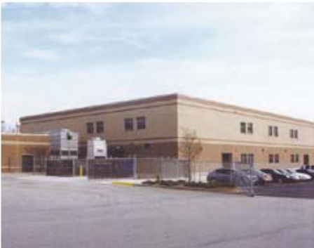
Carroll Daniel Construction Company Addition and Alterations to Chesney Elementary School Duluth