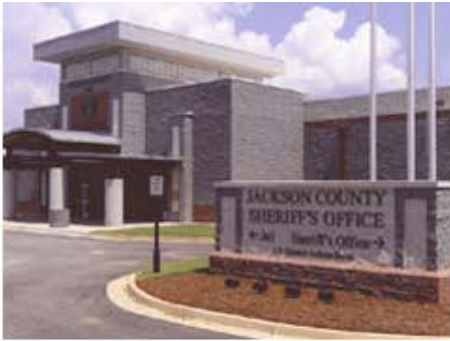
New South Construction Co., Inc. Jackson County Jail Atlanta