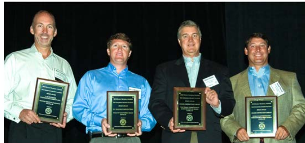
Pictured are representatives of projects awarded merit placement in the Best Sustainable Building Practices category of AGC Georgia's 2010 Build Georgia Awards Program.