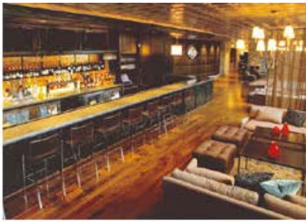
J.M. Wilkerson Construction Company, Inc. The Rialto Room Athens Also took First Place in the Best Sustainable Building Practices Division