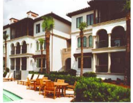
R.J. Griffin & Company Sea Island Beach Club Garden Residences Sea Island