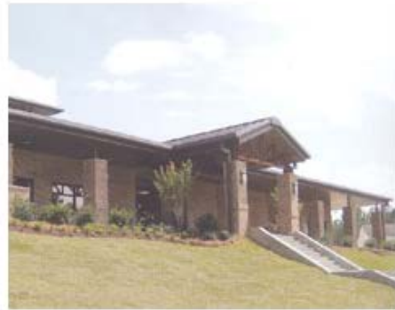
Warren Associates, Inc. 7th Floor Main Renovations - Medical Center of Central Georgia Macon