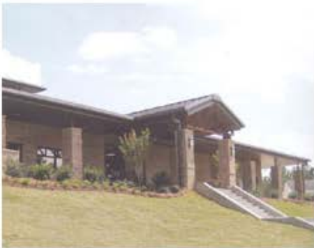
Warren Associates, Inc. Wesley Glen Ministries Life Skills Center Macon