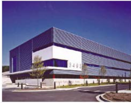
Hogan Construction Group, LLC/Gude Management Group, LLC Atlanta Public Safety Annex Atlanta Also took First Place in the Best Sustainable Building Practices Division