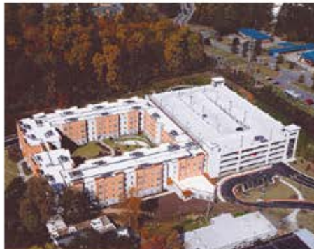
Young Contracting/SE, Inc. Life University Residence Hall/Parking Deck Marietta Also took First Place in the Best Sustainable Building Practices Division