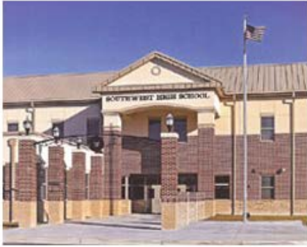
Parrish Construction Group, Inc. Southwest High School Macon