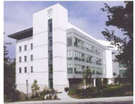
Holder Construction Company Psychology and Interdisciplinary Sciences Building at Emory University Atlanta Also took a Merit Award in the Best Sustainable Building Practices Division