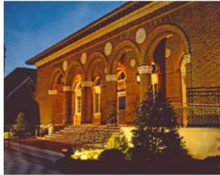
S.C. Barker Construction Tifton-Tift County Public Library Tifton Also took a Merit Award in the Best Sustainable Building Practices Division