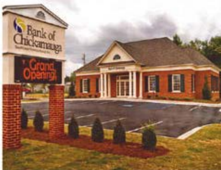
Duffey Southeast, Inc. Southcrest Financial Group - Bank of Chickamauga Chickamauga