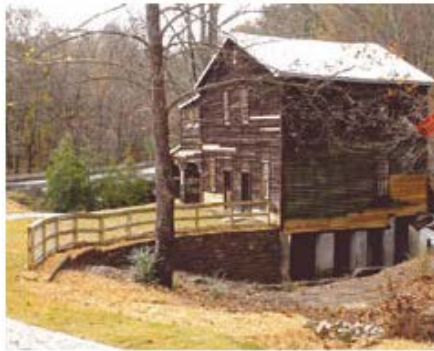
Hogan Construction Group, LLC Freeman's Mill Park Dacula