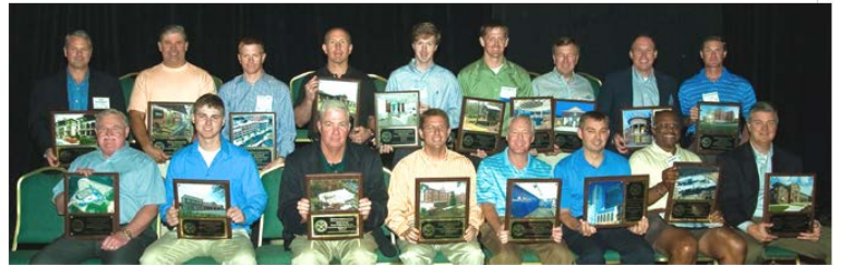
Pictured are representatives of projects awarded merit placement in the General Contractor division of AGC Georgia's 2010 Build Georgia Awards Program.