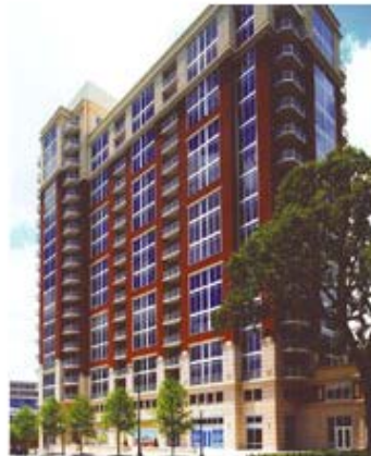
R.J. Griffin & Company The Brookwood Atlanta