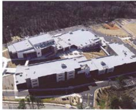
C.D. Moody Construction Company, Inc. Coretta Scott King Young Women's Leadership Academy Atlanta

Also took a Merit Award in the Best Sustainable Building Practices Division