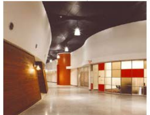
R.J. Griffin & Company Chick-fil-a Oakmont College Park