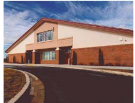
LUSK & Company, Inc. Hapeville Charter Career Academy - 9th Grade Building Union City