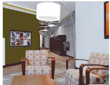
Turner Construction Company Emory University Woodruff Health Sciences Center Administrative Building (WHSCAB) Atlanta Also took a Merit Award in the Best Sustainable Building Practices Division