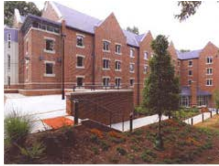
New South Construction Co., Inc. Columbia Theological Seminary - Graduate Student Housing Decatur Also took First Place in the Best Sustainable Building Practices Division