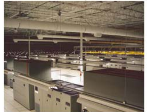
Duffey Southeast, Inc. AT&T Internet Data Center Expansion Lithia Springs