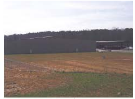
Stroud & Company Georgia Transmission Corporation Forsyth Also took First Place in the Best Sustainable Building Practices Division