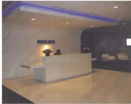
Cork-Howard Construction Company Philips - One Deerfield Alpharetta