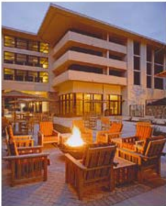
Turner Construction Company Emory Conference Center Hotel Expansion & Renovation Atlanta Also took a Merit Award in the Best Sustainable Building Practices Division