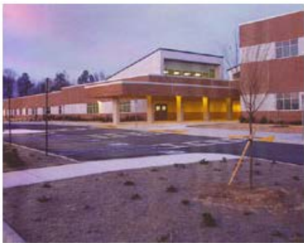
Saliba Construction Company, Inc. Twin Rivers Middle School Lawrenceville