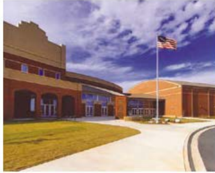
Gilbane Building Company Central High School Macon