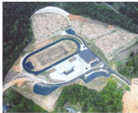
Swofford Construction, Inc. Lanier High School Athletics Facilities Sugarhill