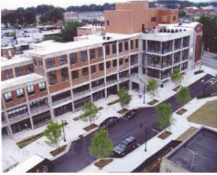
Gay Construction Company White Provisions Redevelopment Atlanta