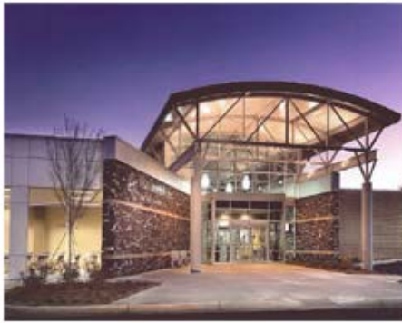
Hogan Construction Group, LLC Tucker-Reid H. Cofer Branch Library Tucker