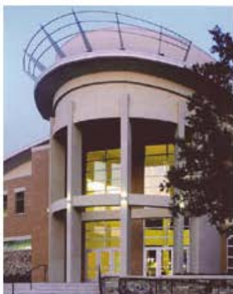
Choate Construction Company - Atlanta Kennesaw State University Student Dining Facility Kennesaw