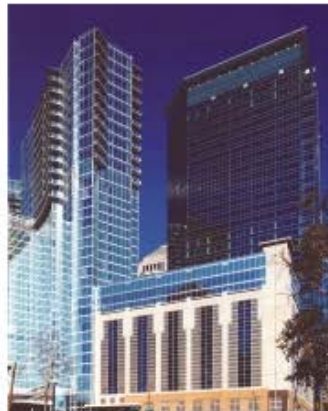
Brasfield & Gorrie, LLC 1075 Peachtree Mixed-Use Atlanta