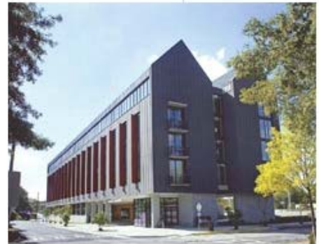
J.M. Wilkerson Construction Company, Inc. Hotel Indigo Athens Also took First Place in the Best Sustainable Building Practices Division