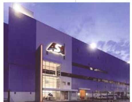
New South Construction Company ASA Technical Center - Renovation Hapeville Also took First Place in the Best Sustainable Building Practices Division