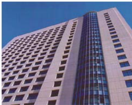
Skanska USA Building, Inc. Omni Hotel Tornado Damage Repair Atlanta