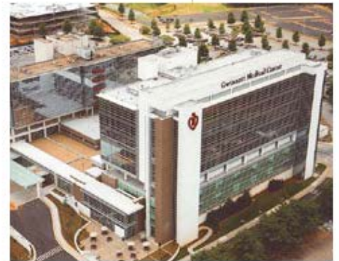
R.J. Griffin & Company Gwinnett Medical Center - Lawrenceville Vertical Expansion Lawrenceville