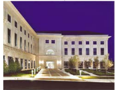
Brasfield & Gorrie, LLC Muscogee County School District Public Education Center Columbus