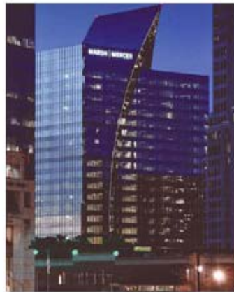
The Beck Group Two Alliance Center Atlanta Also took First Place in the Best Sustainable Building Practices Division