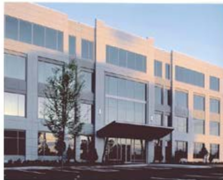
Choate Construction Company - Atlanta Federal Aviation Administration Headquarters Hapeville