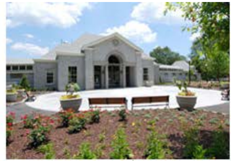
Gay Construction Company Greystone Pool & Bathhouse at Piedmont Park Atlanta Earned First Place in the Best Sustainable Building Practices Division