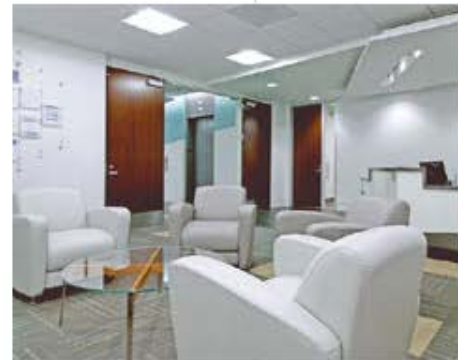
Turner Construction Company Qualcomm Atlanta Also took a Merit Award in the Best Sustainable Building Practices Division