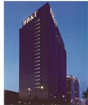
Brasfield & Gorrie 271 17th Street Atlanta Also took a Merit Award in the Best Sustainable Building Practices Division