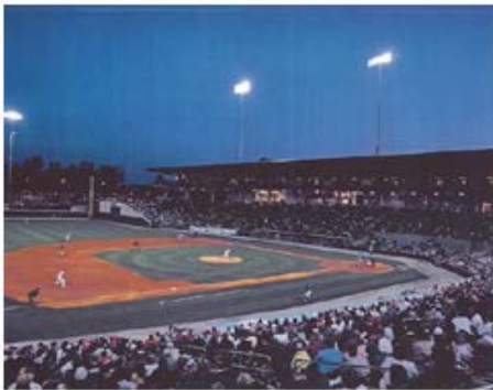
Barton Malow Company Gwinnett Stadium Lawrenceville