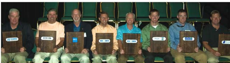
Pictured are representatives of projects awarded first place in the Best Sustainable Building Practices division of AGC Georgia's 2010 Build Georgia Awards Program.