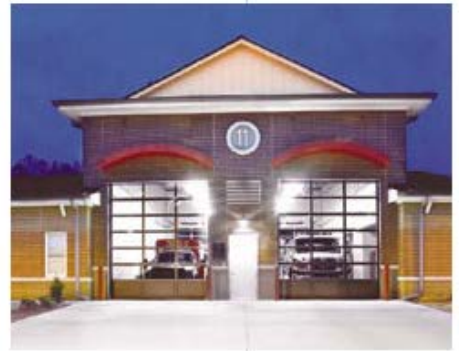
Hogan Construction Group, LLC Paulding County Fire Station 11 Acworth