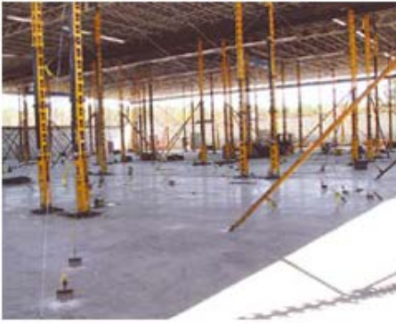
R.W. Allen, LLC Augusta Sportswear Rooflift Augusta