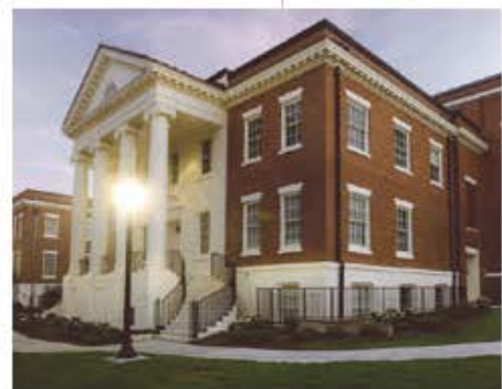
Garbutt/Christman, A Joint Venture Partnership Health Sciences and Parks Memorial Historic Restoration and Rehabilitation Milledgeville