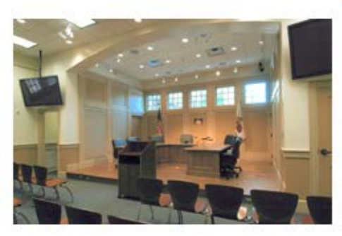
Van Winkle & Company, Inc. Decatur City Hall Decatur, Georgia