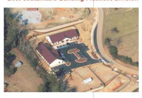
Collins & Company The Village at Pinnacle Pointe Buford, Georgia