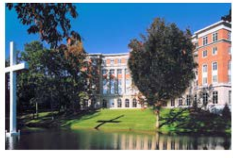
Brasfield & Gorrie, LLC Georgia Baptist Convention Duluth, Georgia