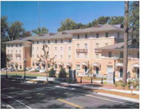
New South Construction Company, Inc. Emory University Sorority Housing Complex Atlanta, Georgia Also took Honorable Mention in the Best Sustainable Building Practices Division