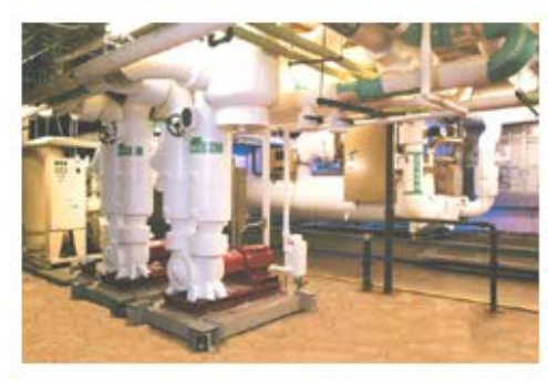
Cork-Howard Construction Company, Inc. DeKalb Medical Center - Chiller Replacement Decatur, Georgia