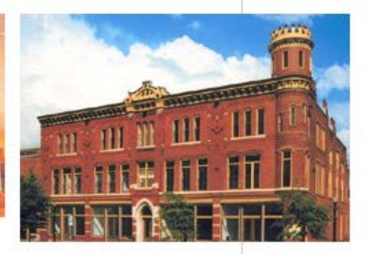
Garbutt Construction Company Restoration and Renovation of the Macon Volunteers Armory Macon, Georgia