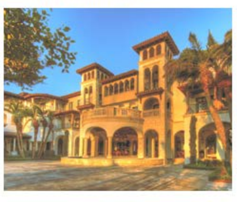
Batson-Cook Company Cloister Main Hotel Sea Island, Georgia