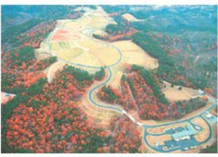
J. M. Wilkerson Construction Company, Inc. Georgia National Cemetary Canton, Georgia