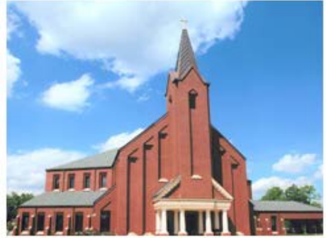
Carroll Daniel Construction Company St. John Baptist Church Gainesville, Georgia