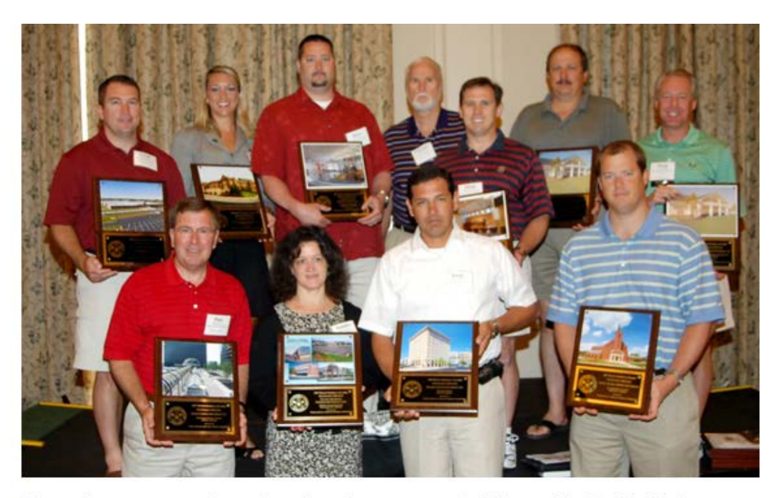
Pictured are representatives of projects that were awarded Honorable Mention in the General Contractor Division of the 2007 Build Georgia Awards Program.