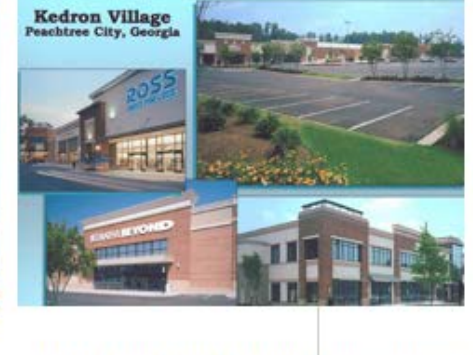
Collins and Arnold Construction Company, LLC Kedron Village Expansion Peachtree City, Georgia