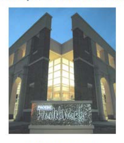
Alcon Associates, Inc. Healthworks Employee Wellness and Fitness Center Albany, Georgia