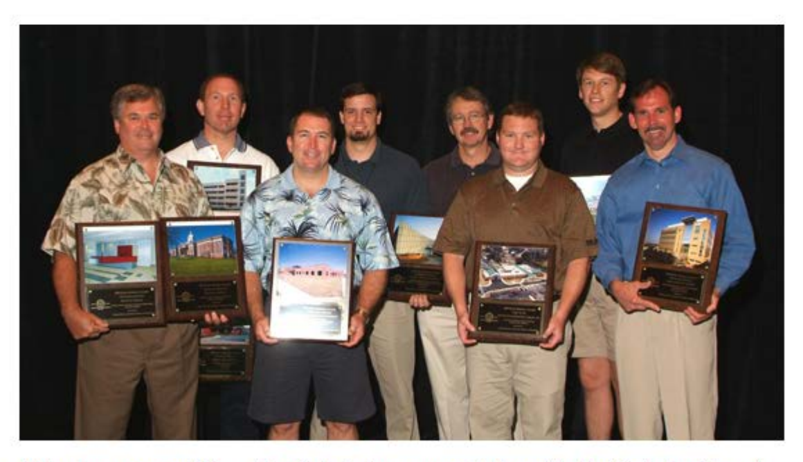
Pictured are representatives of projects that were awarded Honorable Mention in the General Contractor Division of the 2006 Build Georgia Awards Program.