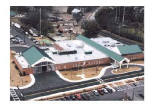
New South Construction Company, Inc. College Park Public Safety Complex College Park, Georgia