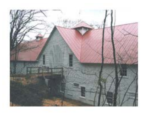
J.M. Wilkerson Construction Company, Inc. Hardman Farm Phase I Stabilization Sautee Nacoochee, Georgia