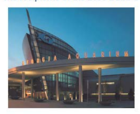
Brasfield & Gorrie, LLC Georgia Aquarium Atlanta, Georgia