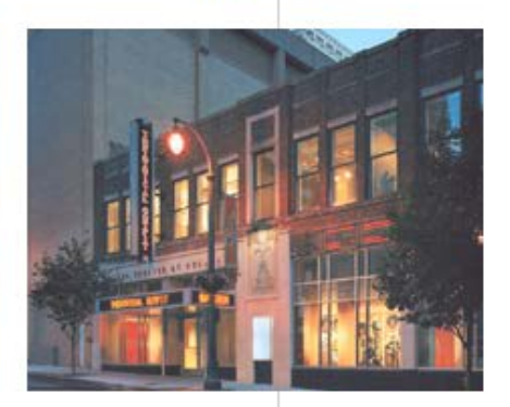
Gay Construction Company The Balzer Theater at Herren's Atlanta, Georgia