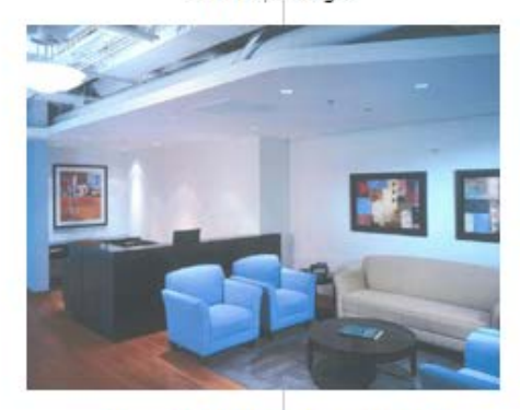
Holder Construction Group, LLC GSFIC Trinity Washington Building Renovation Atlanta, Georgia