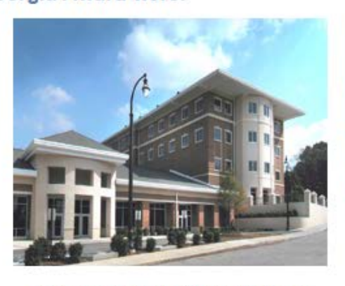
C.D. Moody Construction Company, Inc. The Leadership Center at Morehouse College Atlanta, Georgia