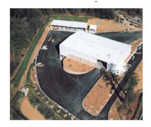
Lusk & Associates, Inc. Plant Atkinson MSW Transfer Station Smyrna, Georgia