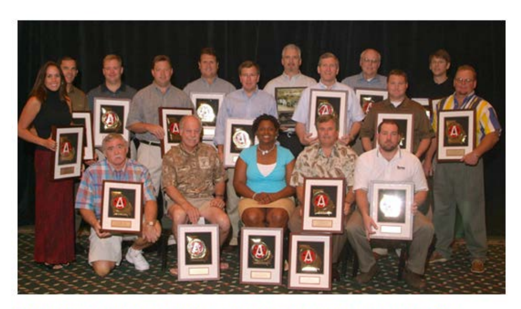
Pictured are Representatives of projects that were awarded first place in the General Contractor Division of the AGC Georgia's 2006 Build Georgia Awards Program.

Each year a panel of industry professional select outstanding construction projects to receive the Build Georgia Award, and the Build Georgia Specialty Award, AGC Georgia's highest levels of distinction